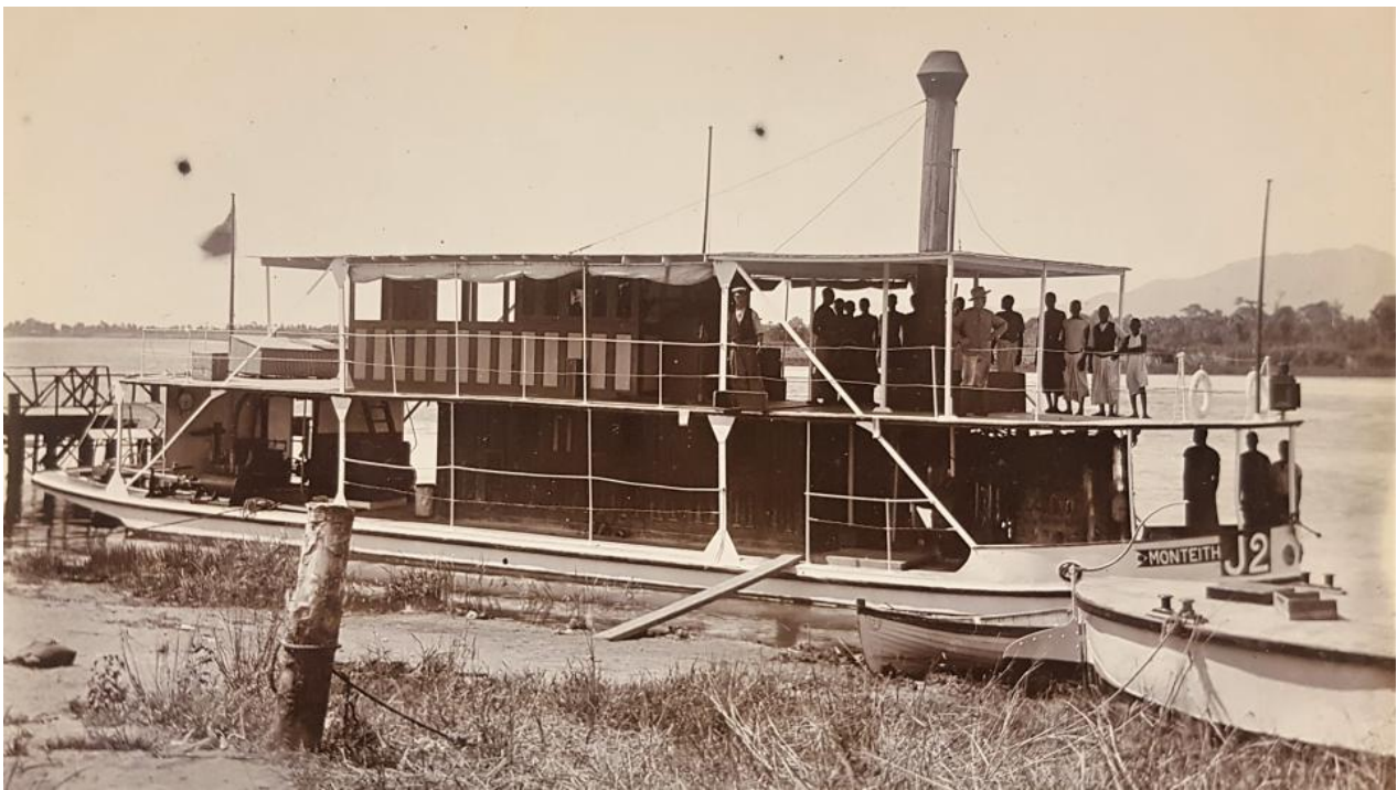
African Lakes Corporation steamers such as this were the primary form of both freight and passenger transport until the coming of railways.

season no river at all, only here and there pools of water separated by sand-banks or barriers of reeds and cabbage plant, the water being only a few inches in depth” ( Life and Work in British Central Africa , September 1905, quoted in Mandala 2006).