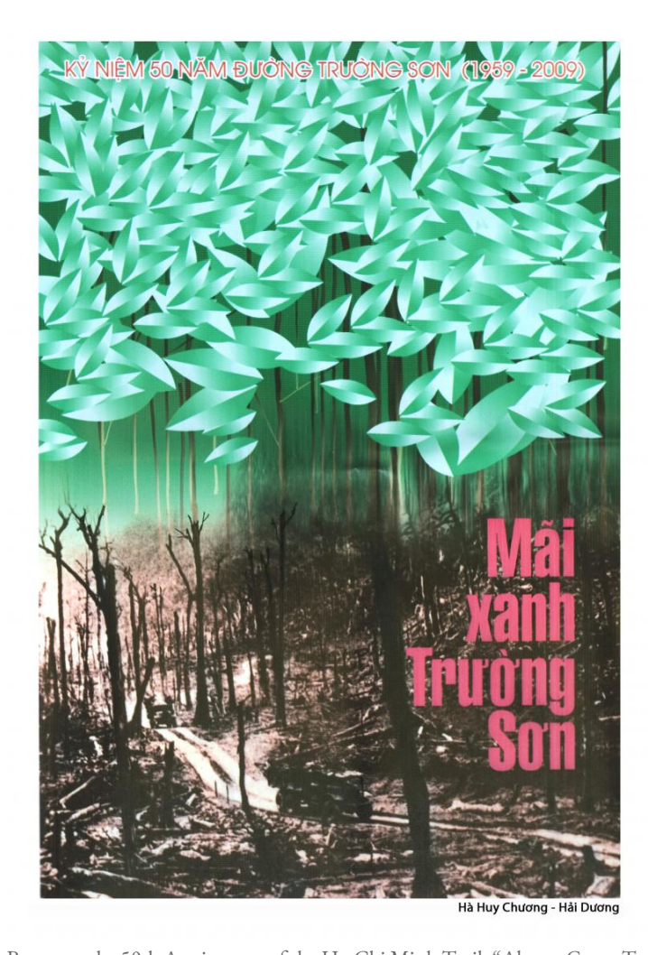
Poster on the 50th Anniversary of the Ho Chi Minh Trail: "Always Green Truong Son" (Truong Son is the mountain range through which the Trail ran).