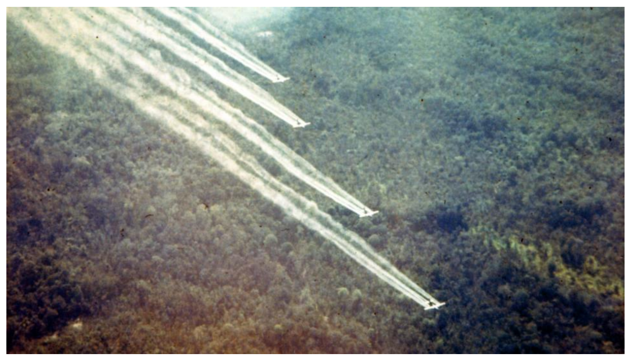
UC-123 airplanes spraying herbicides in central South Vietnam, 1966. Unknown photographer, 1966. Courtesy of the National Museum of the US Air Force.

This work is licensed under a Creative Commons Public Domain Mark 1.0 License.