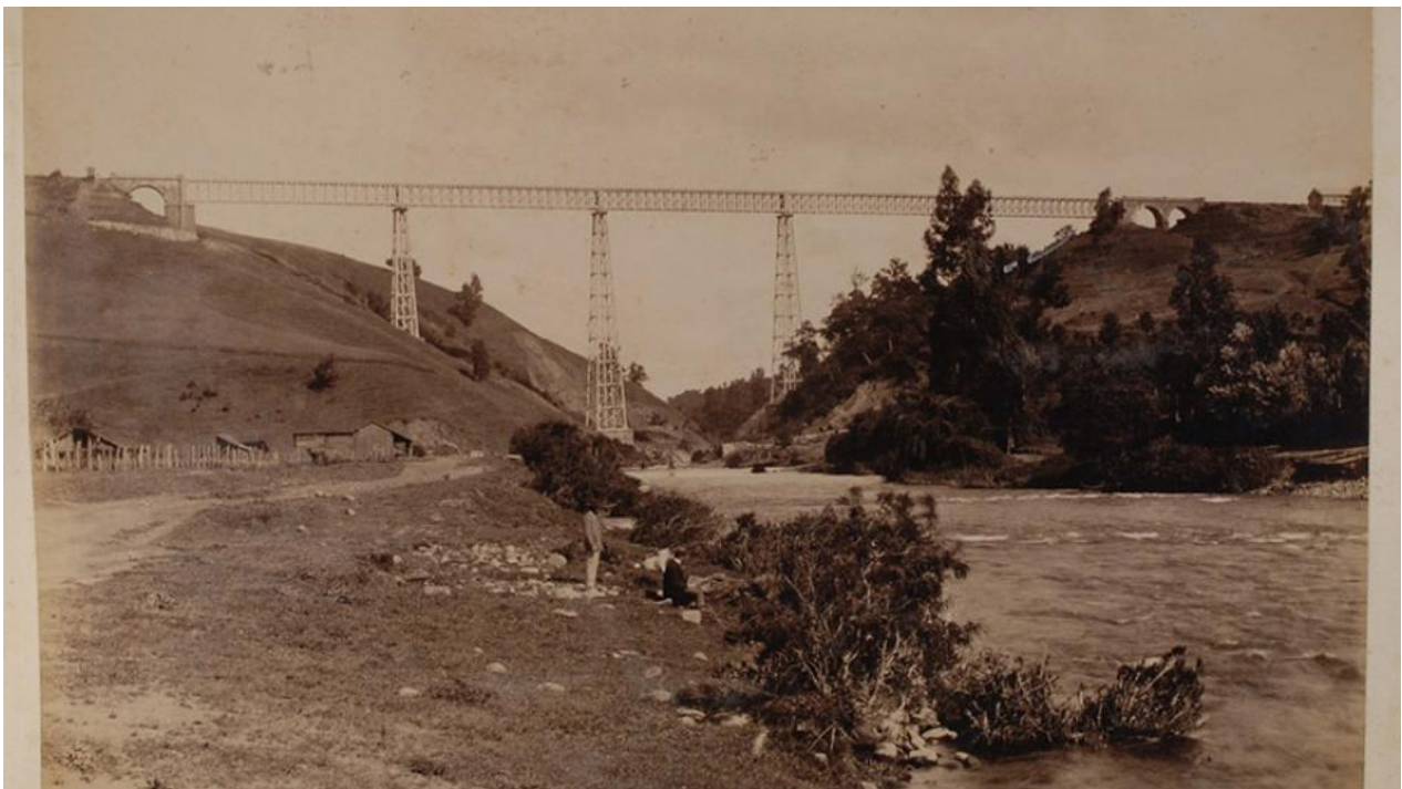
The Malleco Viaduct in 1890, with a length of 408 meters and a height of 102 meters.

What we need more in the Araucania are good communication networks. Open the Cholchol road, repair the roads of Contulmo, Vega Larga, the Malleco line, and the Collipulli to Mulchén line. It should be done by the engineers before next winter, beginning soon. Then we will have done more for the conquest and domination of the Araucania, than what we would have done through many years of war and combat.