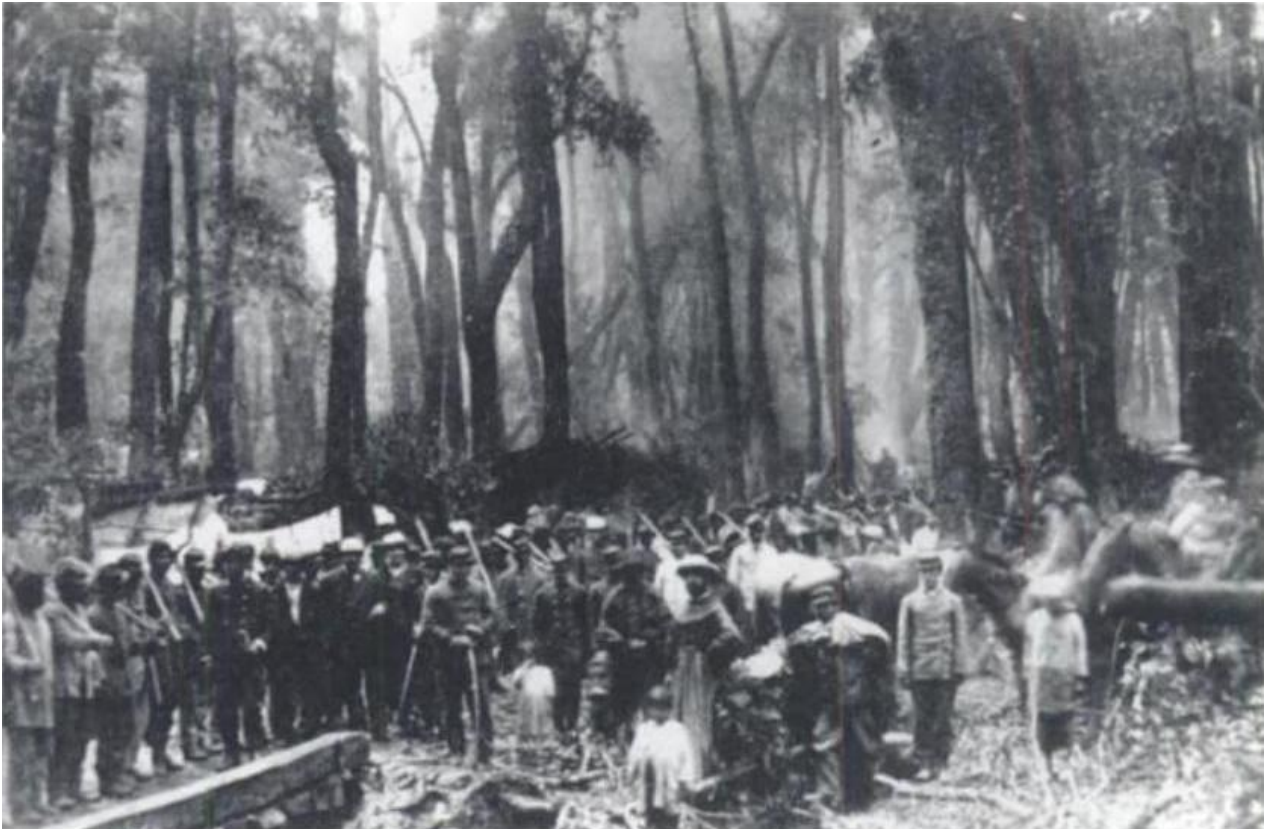
Chilean troops during the occupation of the Araucanía. Note the forest in the background.

It is advisable for the development of agriculture, industry, and commerce and to the best service of the military operations in the Arauco provinces, Bío-Bío and the Colonization Territory, the organization of an engineer battalion to be in charge preferably of the opening, repairmen, and conservation of public roads, bridges, telegraphs, barracks, hospitals, fortifications, and other public works to be done.