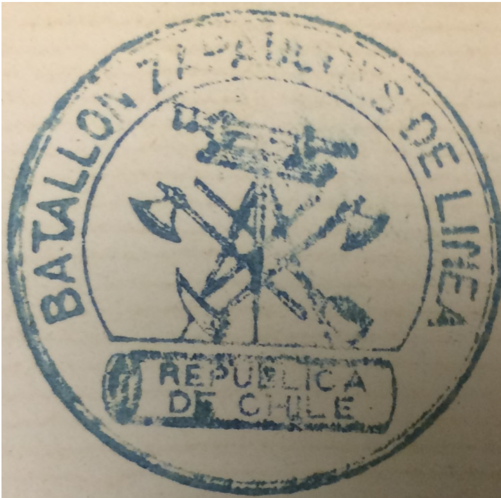
Engineer battalion water print, 1879.