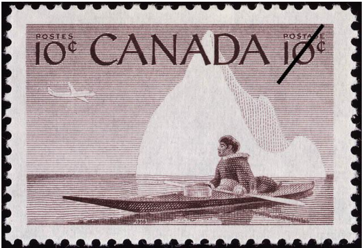
“Eskimo hunter” 10-cent stamp, 1955.