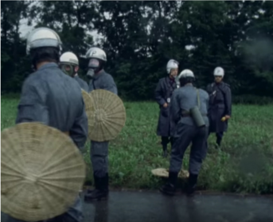
Policemen in riot gear, 27 June 1.