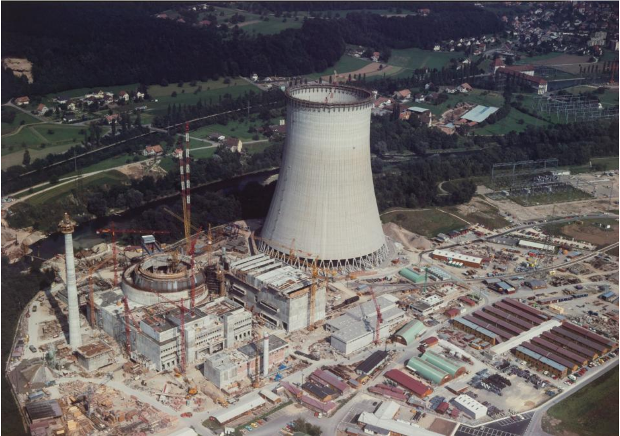
The construction of Gösgen Nuclear Power Plant in 1976.