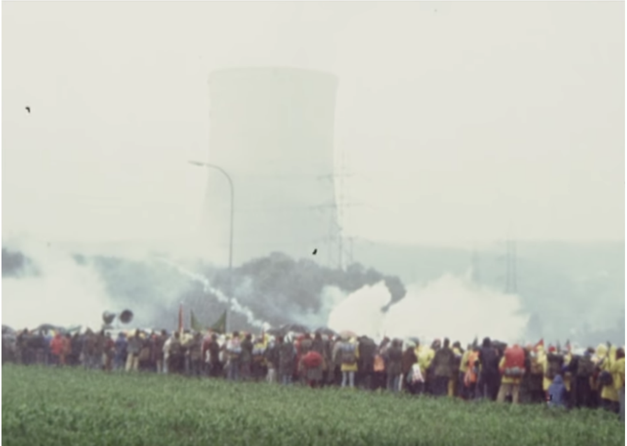
Protest mobilization against the construction of Gösgen Nuclear Power Plant, 27 June 1977.

Unlike a church, however, the power plant emerged as a publicly inaccessible site perceived as disturbing the scenery through its towering presence. As noted by historian Patrick Kupper, concerns were in part articulated as demands for the cooling tower to be painted in order to camouflage its concrete structures, assimilating it into the surrounding landscape, though these were not met.