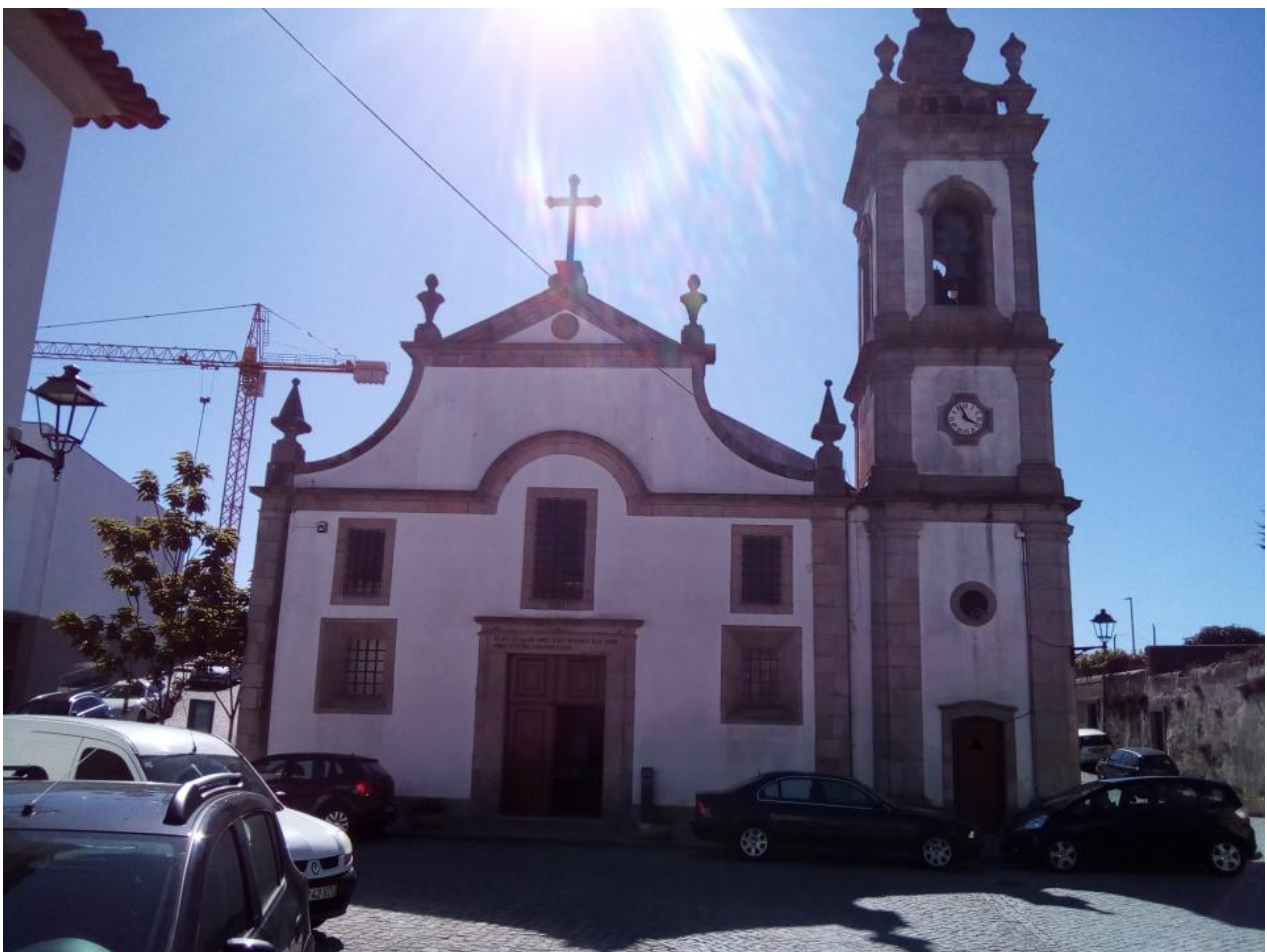
The Parish church of St. Pelagius was destroyed several times by sands.

Saint Pelagius Church and the Fort of St. John the Baptist were particularly badly affected because they were the closest to the sea and, during 1700–1750, there was a great absence of vegetation that could have defended buildings against windblown sands.