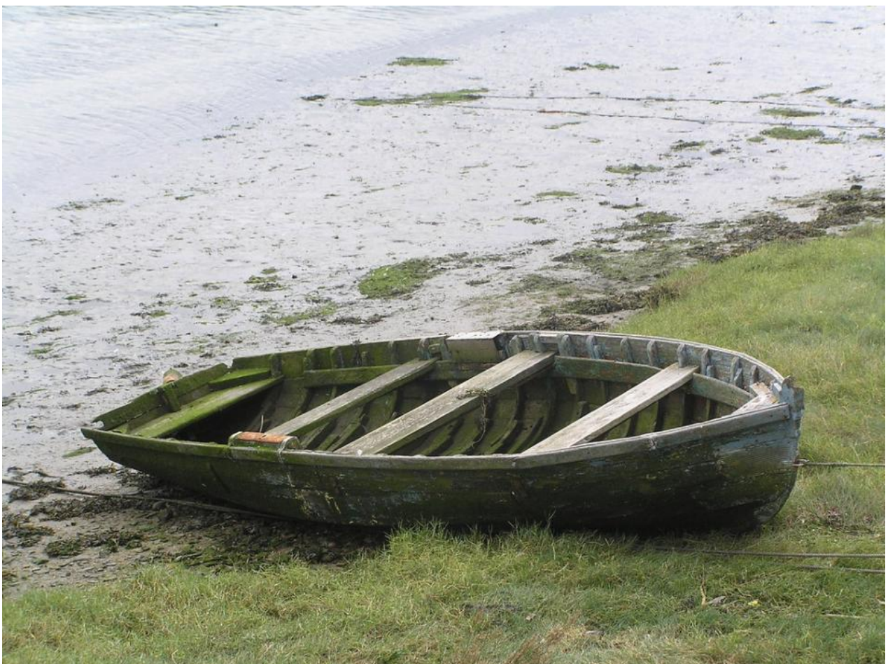
Beached boat at the Cávado river mouth.

Thirdly, accumulated sands in agricultural fields decreased their productivity. In the seventeenth century, sand accumulation in Santa Casa da Misericórdia de Fão’s fields led to migration or to a preference for the cheaper Ducal House of Braganza’s fields. The same happened on the coast of northwestern France, in the eighteenth century, where tumultuous winds deprived parishes of linen.