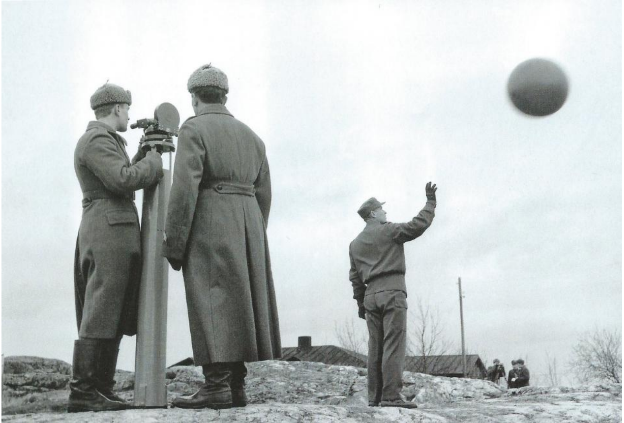
The launch of a weather balloon at the Vallisaari military meteorological station in 1962. According to Enqvist and Eskola, the task of the centre was to train conscripts as well as regular persons in the skills of meteorology.

in 1917. Weapons and explosives were stored by the Finnish Defence Forces on Vallisaari until recently. In addition, a residential community of 300 residents flourished in the 1950s. In the years following, the military reduced its operations on the island and, in 2008, the Finnish Defence Forces announced their departure from the island. Subsequently, in 2013, National Parks Finland initiated a project to prepare the opening of the islands to visitors. Vallisaari was finally opened to the public in 2016, as a wilderness among the cannons.