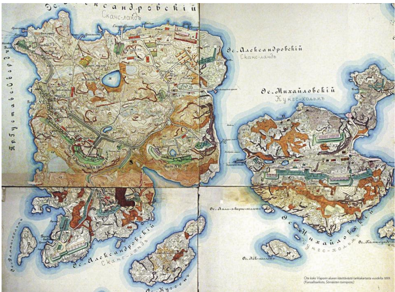
Map of Vallisaari (left) and Kuninkaansaari (right) from 1899, showing the various military buildings, housing, ammunition storages, and batteries. Most of these structures are today in ruins taken over by the wilderness.

By the beginning of the twentieth century the island of Vallisaari in the Helsinki archipelago was left bombed, cratered, and barren by the various multi-national militaries of the region. However, with the gradual abandonment of the island, wilderness took over, bringing with it a rich diversity of plants, animal species, and habitats. Today, infrastructural works to support cultural and touristic development, as well as to host an international arts biennial, threaten to change Vallisaari’s landscape and ecosystem.