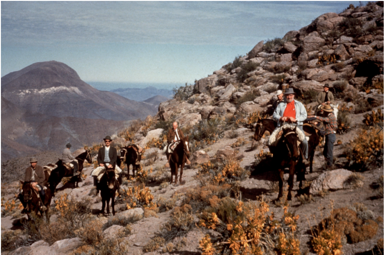
Americans and Europeans meeting on Cerro Morado, Coquimbo Region, Chile 1963.

several mountains in the Coquimbo region and determine which place had the best conditions for astronomical observation. For this, he had sophisticated equipment: every time he climbed a mountain, he had to bring an interferometer with him to measure the wavelength of light very accurately. Also, he had to carry a Danjon telescope to make sure visibility was of the quality they were aiming for. According to Stock's reports, interferometers caused quite some excitement among local people. It was new technology, complicated apparatus they were not familiar with.