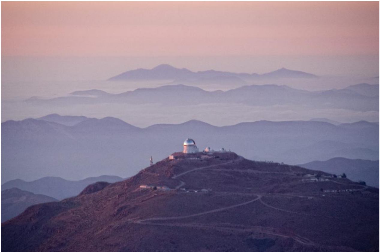
The Cerro Tololo Inter-American Observatory.