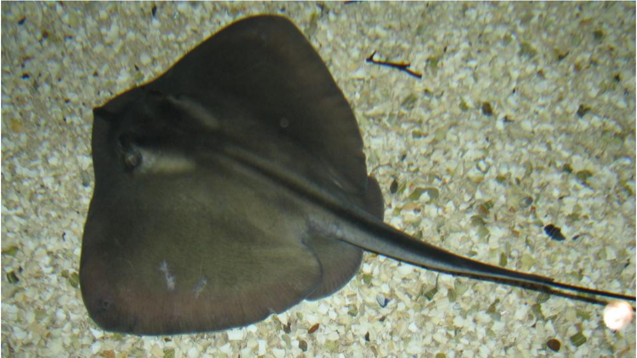
The common stingray ( Dasyatis pastinaca ).