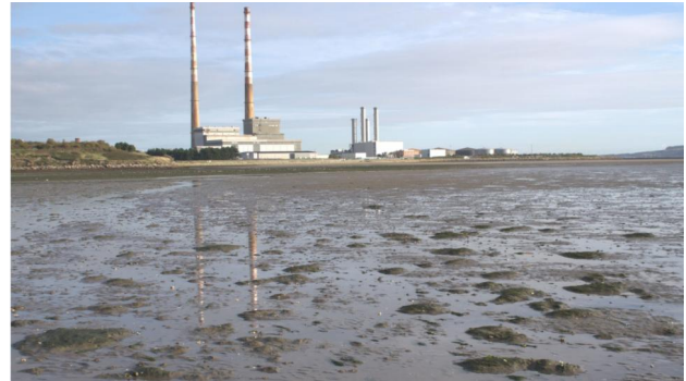
Ringsend's generating station in 2017. The Poolbeg chimneys are colloquially known as the "Poolbeg stacks."

The copyright holder reserves, or holds for their own use, all the rights provided by copyright law, such as distribution, performance, and creation of derivative works.