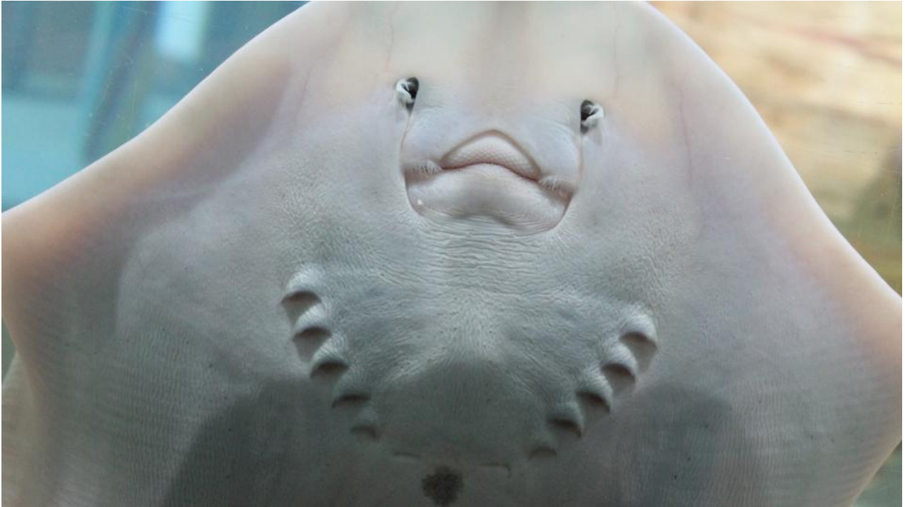
A smiling stingray (its underside) in Portaferry Aquarium.