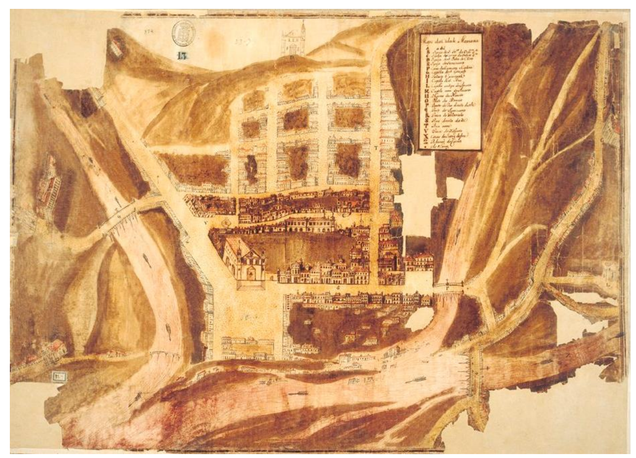
Fig. 2. Map of the city of Mariana showing, in the bottom part, one of the floods that afflicted the city in the eighteenth century,

In that historic moment, in which Mariana had just received the status of town, the Council Chamber was worried about keeping the territory compatible with the "civilized" standards of the town category, and the floods were seen as obstacles to reaching this goal, since they destroyed buildings, religious temples, and public ways in the urban center, as represented in Figure 2.