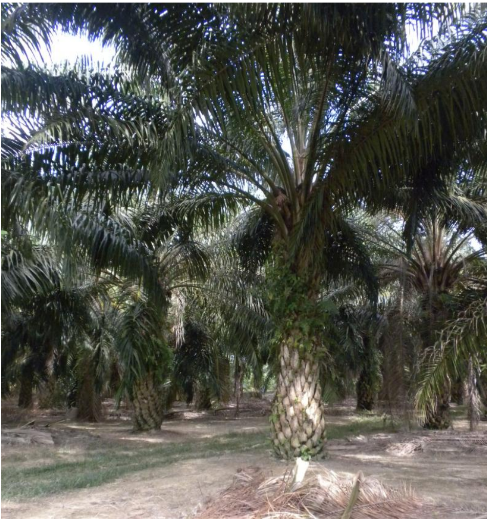
A mature oil palm plantation near Melaka, Malaysia.

The first oil palm plantations relied on human interventions for the sexual reproduction that made the palm oil industry possible. Scientists discarded evidence about insect pollinators, only to rediscover them later in the twentieth century. The “million dollar weevil” transformed oil palm cultivation in Southeast Asia, but new problems with disease and hybrid trees cast shadows over its future.