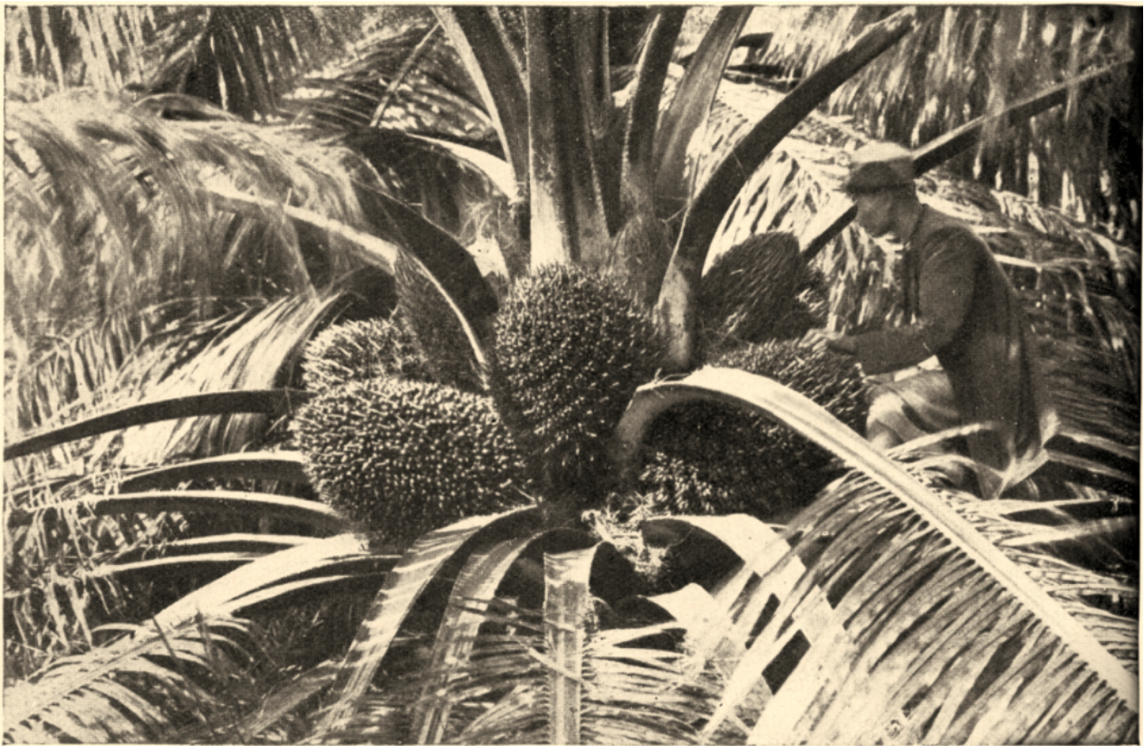
A worker posed next to gigantic fruit bunches, the result of artificial pollination.

When Europeans carried Elaeis guineensis from its homeland in western Africa to Southeast Asia in 1848, they left its native pollinators behind. Initially, that didn't matter: after failed experiments with palm oil production, the trees were relegated to ornamental roles. That changed in 1911, when the first large-scale oil palm plantations broke ground, hoping to compete with Africa's long-established export trade in palm oil. Plantation managers dealt with pollination the same way they built their plantations and harvested palm fruit, with cheap labor. Workers bound by coercive "coolie" contracts carried out this reproductive work, gathering pollen and dusting it onto female flowers, marking each blossom with a dot of paint to prove the work was done.