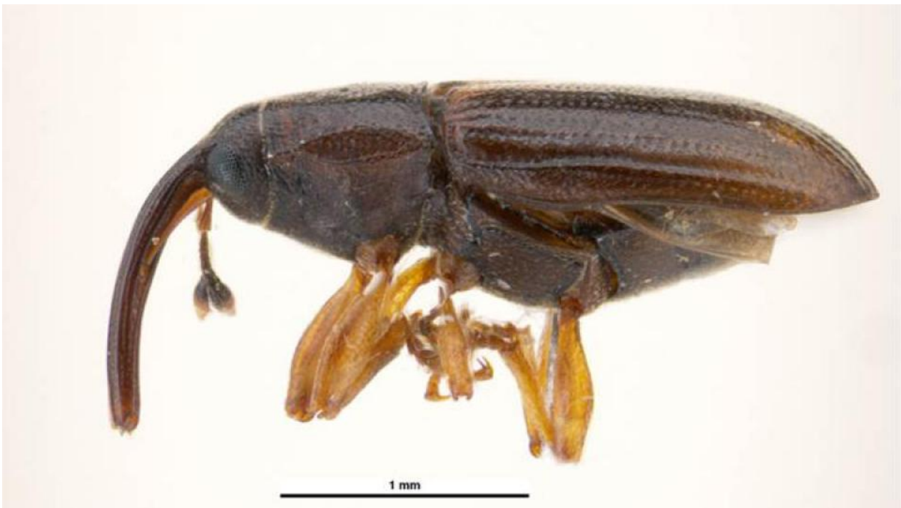
A female oil palm weevil, Elacidobius kamerunicus .

We do not yet know whether its danger as an enemy is not greater than its usefulness and we do not know what ill we may perhaps be importing. (Heusser 1922: 55)