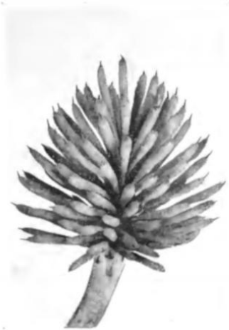
Fig. 1. Mannelijke bloeiwijze

smallholder activism, and freedom from colonial rule remade the political economy of labor for the plantations. The palms had their own agenda, too: now over 20 years old, most plantation palms in the region had grown to towering heights by the 1940s. Pollinating and harvesting fruit became slow and hazardous tasks accomplished on ladders. For the tallest palms, plantation managers let the wind and native insects like Thrips hawaiiensis do the work. Many plantations began cutting down and replacing palms with higher-yield hybrids in the 1960s, restarting the cycle.