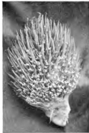
Fig. 2. Vrouwelijke bloeiwijze.