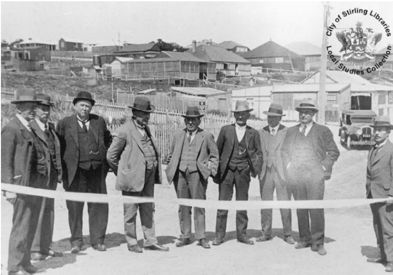
Official opening of the Esplanade, 1932

coastal dunes occurred when a section was removed during the construction of the bituminized road called The Esplanade .