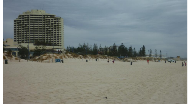
Scarborough Beach and the Rendezvous Hotel, 2010.

The copyright holder reserves, or holds for their own use, all the rights provided by copyright law, such as distribution, performance, and creation of derivative works.