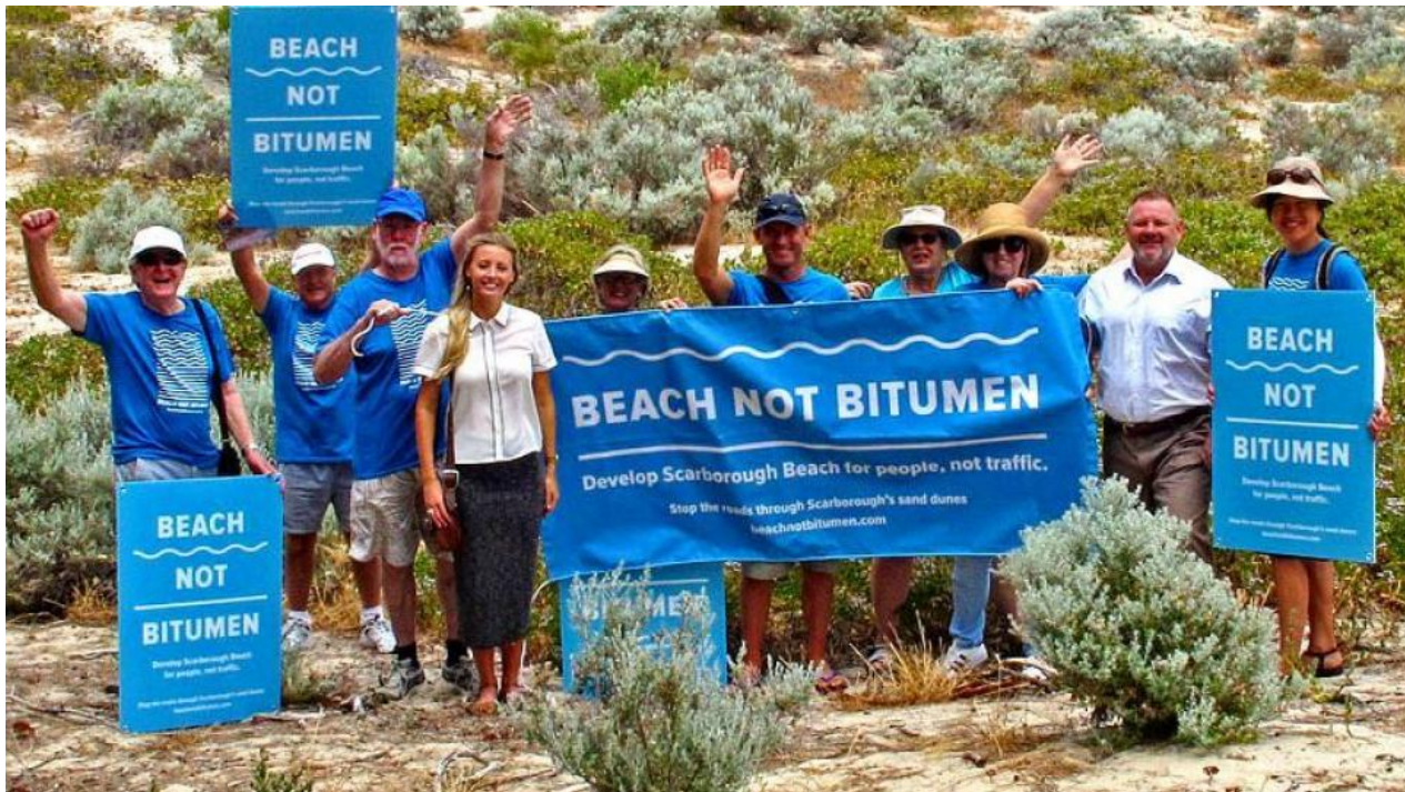
Photograph of Beach Not Bitumen campaigners at the proposed road-extension site.

Yet again, success seemed on the horizon when permanent protection for the site was given a year later in 2017. And yet again another development application to clear dune habitat was proposed, this time as part of a 10-story development approved by the MRA and incongruously called “The Beach Shack.” Beach Not Bitumen continued their campaigning until finally, by 2019 the application was withdrawn and the dunes fully encompassed within the South Trigg Class A Reserve. After almost 40 years of community effort, this unique coastal dune ecosystem had been protected.