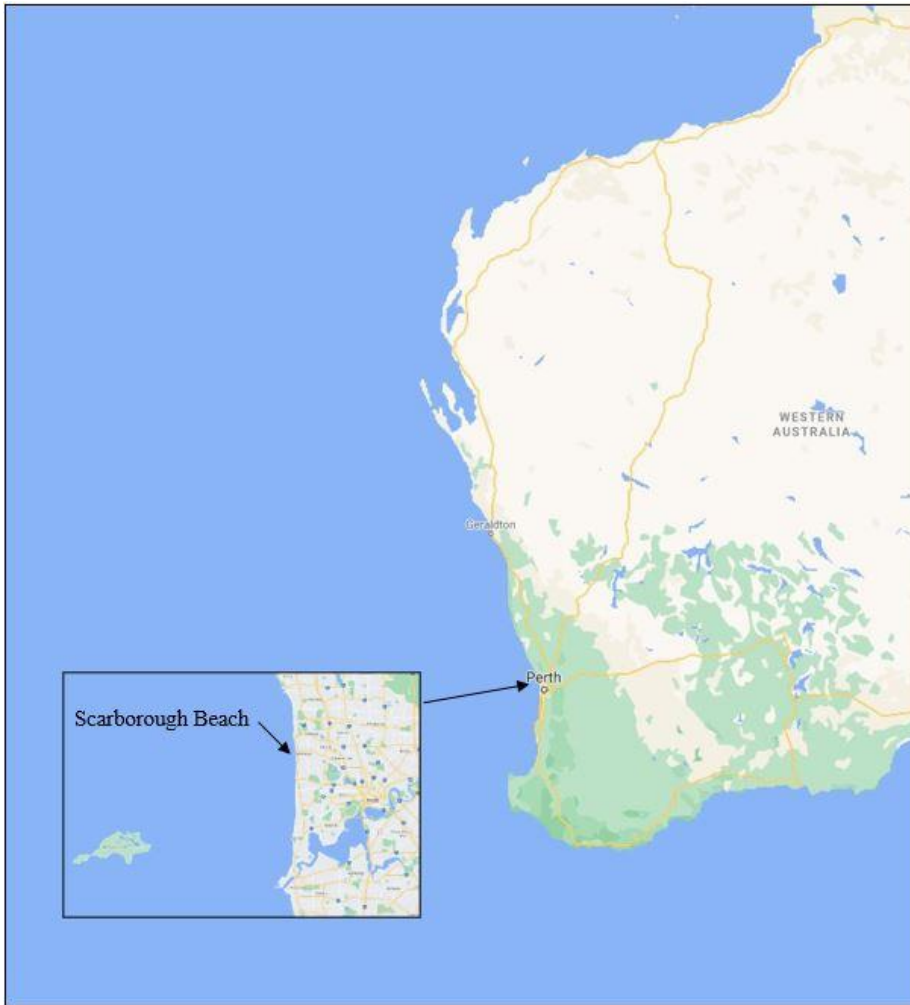
Map of Western Australia and Scarborough Beach.