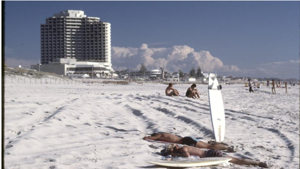
Bond’s Observation City Hotel, Scarborough Beach, 1987.

road through the Trigg Bushland. Although the Trigg Dune Heritage Group had laid a foundation for the campaign, the pro-development ethos was too strong. Both the tower, now called the Rendezvous Hotel, and the road were built. By 1992 Alan Bond was declared bankrupt and jailed, while the “WA Inc” scandal involving corrupt dealings between business and the Labor Premier Brian Burke was revealed.