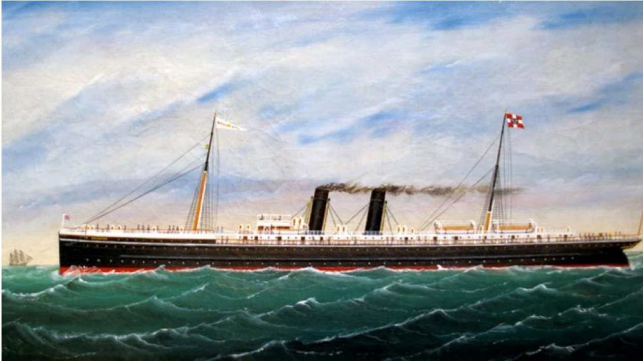
A naval portrait of RMS Leinster showing the vessel in peacetime. Oil on canvas; H 43.5 x W 83.5 cm, 85/205/1, 1900.