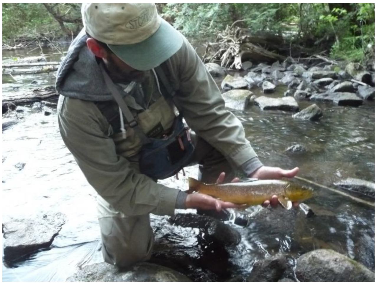
Non-native brown trout caught with a fly rod on a small stream in Southwestern Ontario, Canada.