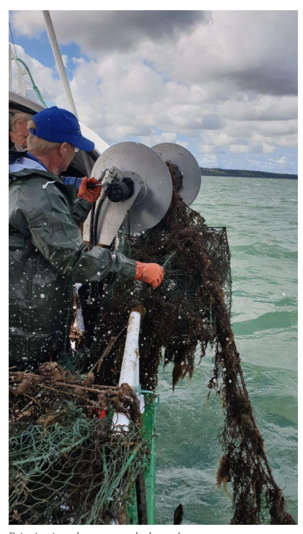
Bringing in a ghost net on the boat Anton.