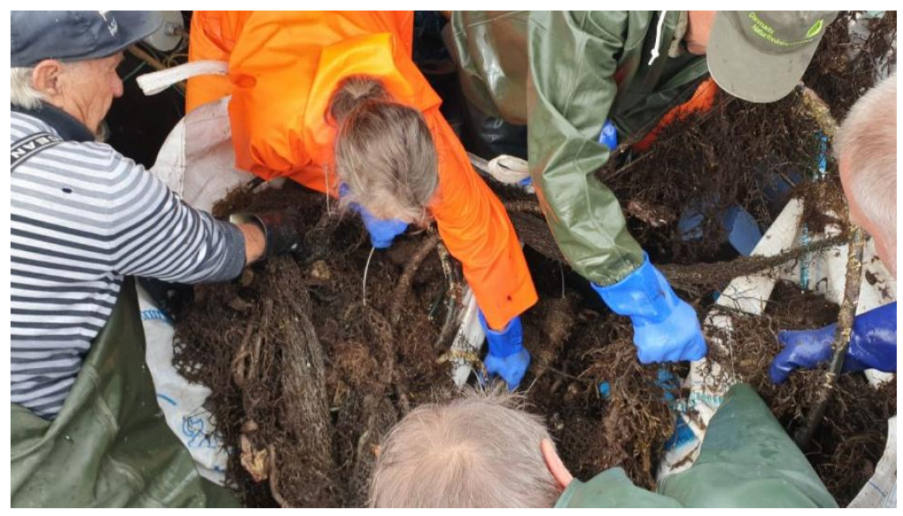
Bags of forgotten prisons.