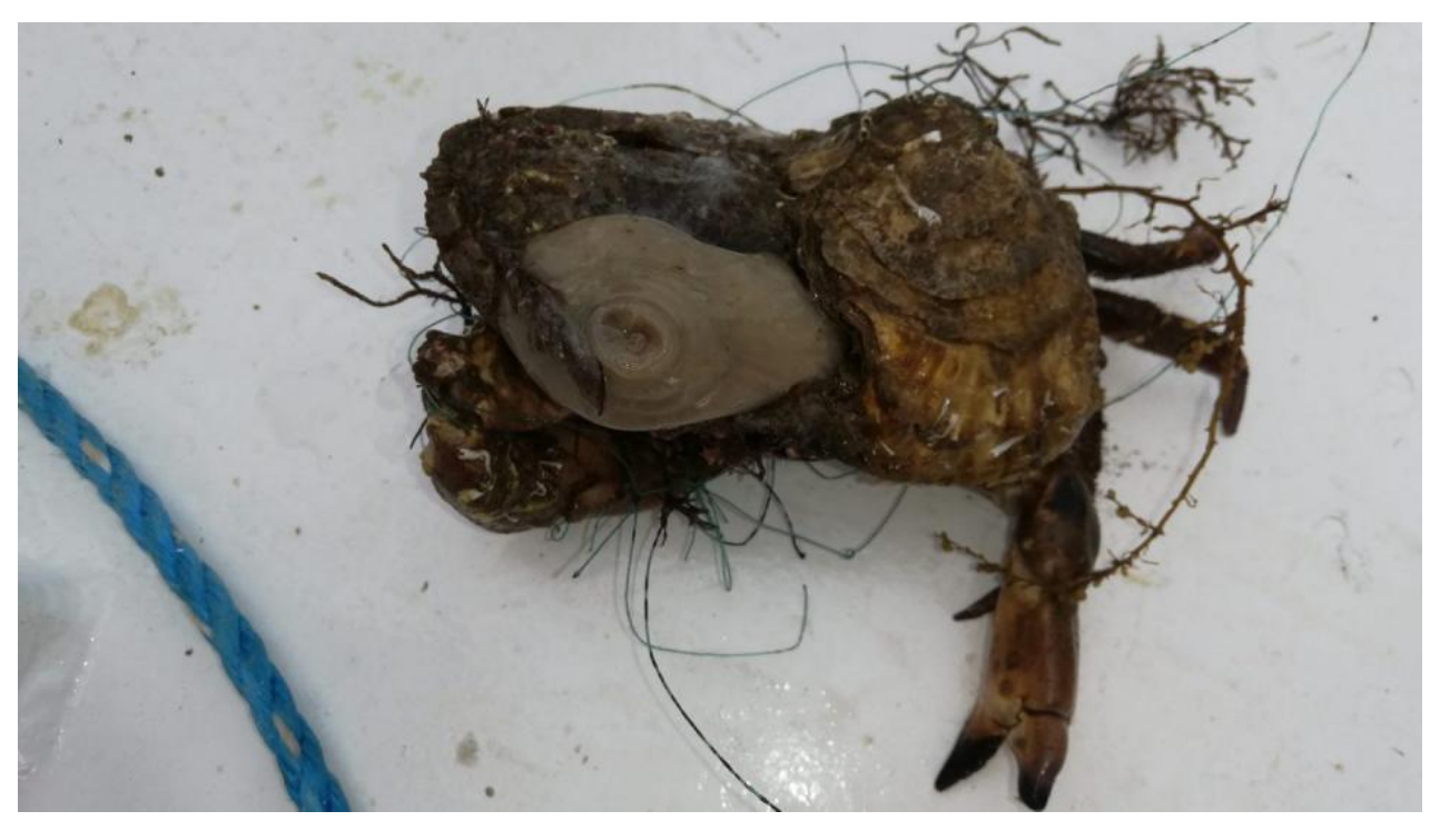
A sea anemone and an oyster has attached itself to a crab barely alive. The crab must have been trapped in the net for months.

In time, the ghost nets become so filthy that the effort required to restore them surpasses the gain from collecting them and selling their catch. When inadvertently recuperated, precious lobster may be cut free, further deteriorating the worth of the net. Meanwhile, only the crabs' claws are harvested because they are the only thing worthy of commodification. Torn limb from limb, the crabs' dismembered bodies remain in their entangled prison. Finally, the nets are re-submerged and abandoned because both the nets and the clawless crabs are deemed worthless.