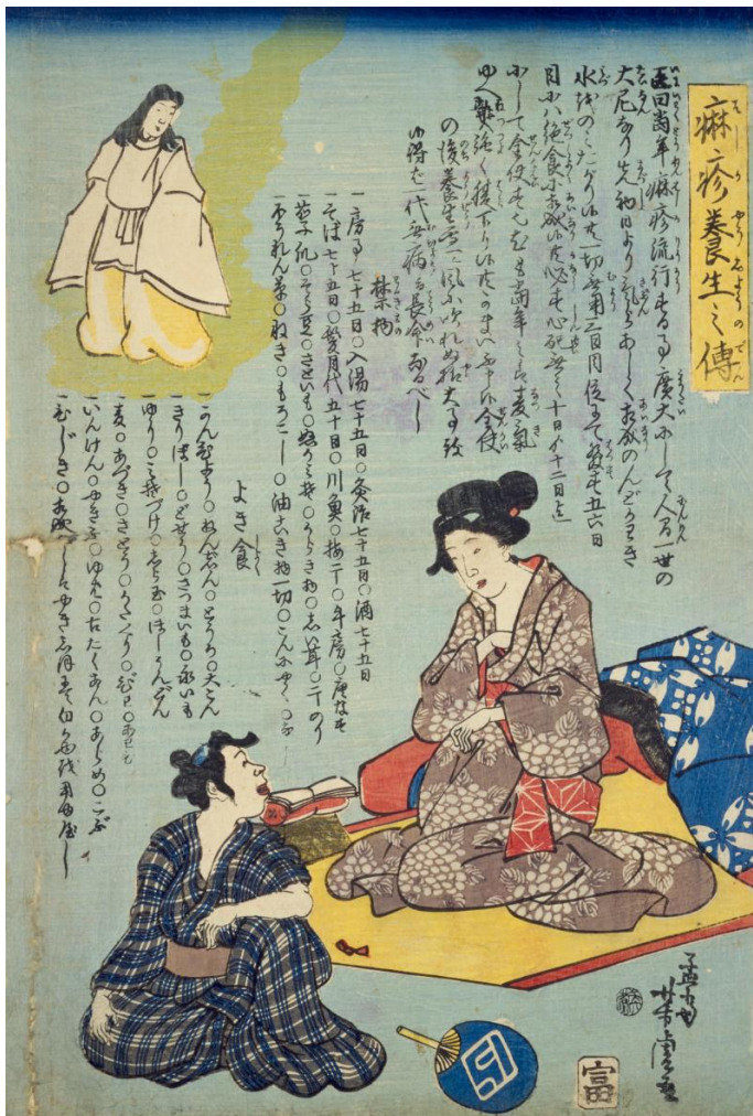
Hashika yōshō (yōjō) no den is a hashika-e focusing on curing measles. It provides an overview of the symptoms of measles and recommendations about diet and behavior. The image appears to show a woman who has been recovering from the disease.

Courtesy of the National Diet Library Digital Collections. Click here to view source .