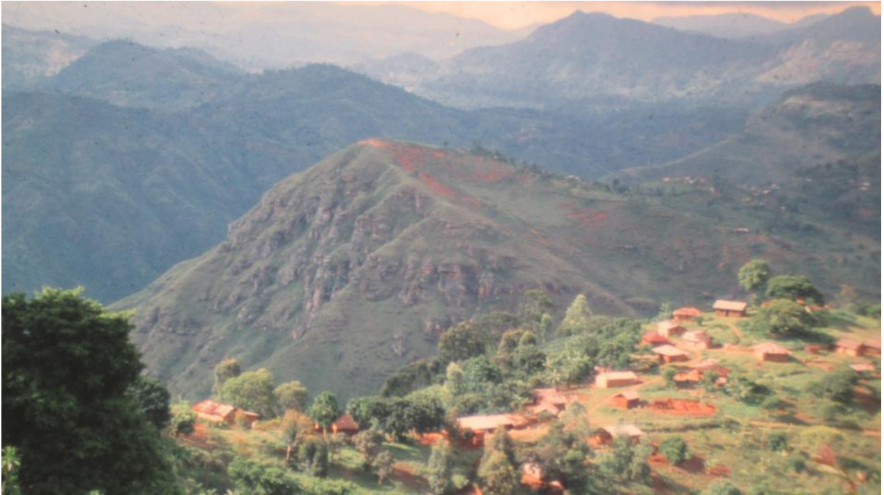
West Usambara Mountains in Northeast Tanzania, approximately 75 kilometers inland of the Indian Ocean.