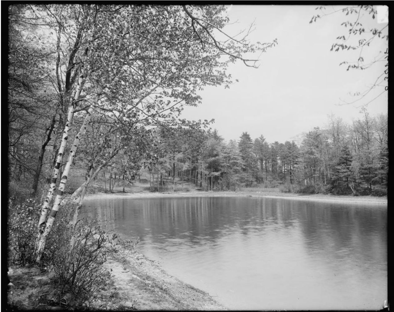
Photograph of Walden Pond, 1900–1910.

sitting on a stump by my door” ( Walden ). In this way, we might see the book itself as cocreated within multispecies relationships, arising out of a conversation among the chickadees and the whippoorwills and the workers, among other members of the Walden Woods society that I describe in my recent book, Thoreau’s Religion .