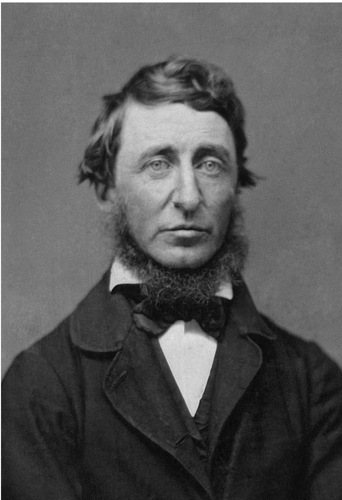
Daguerreotype of Henry David Thoreau in June 1856.

Walden Woods has been rendered as a kind of wilderness, and Henry David Thoreau is often taken to be an icon of individualism. However, recent work in environmental history suggests that even familiar evidence may look different when viewed through the lens of multispecies studies. We can find a more relational vision of Thoreau's religion if we are willing to admit the other members of Walden Woods society into the frame.