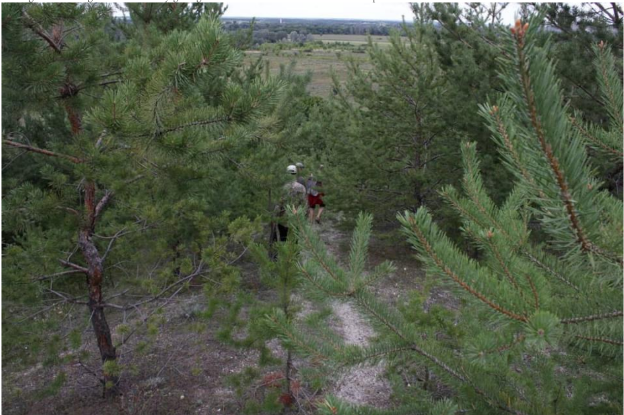
Kreidova flora nature reserve, Donetsk oblast, Ukraine, 2019.

In the environments of post-Soviet and post-Russian spaces damaged by Russia's war against Ukraine, we need a postcolonial and decolonial reading of the entanglement of military-geologic extractivism at the core of Russian imperialism.