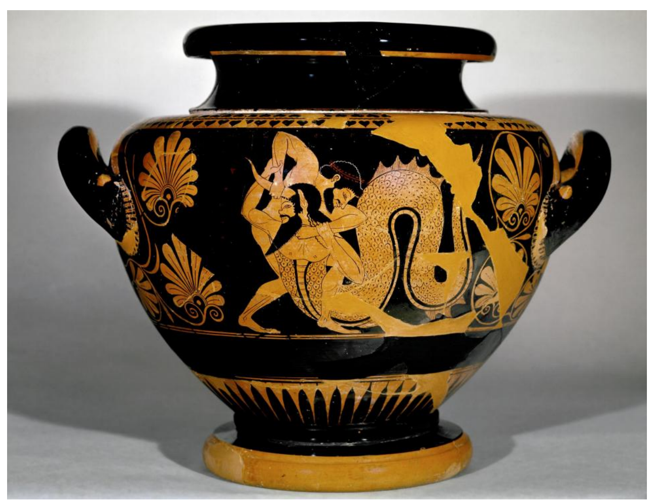
Heracles fighting Achelous.

The most salient example appears in Homer's Iliad , Book 21. The Trojan river Scamander (or Xanthus, meaning "yellow," reflecting the colour of sandy water; today called Karamenderes River) has both human agency and divine power. The powerful stream, conceived as a bull, fights the Greek hero Achilles and almost kills him. The episode occurs after the raging hero Achilles, angry because of the death of his friend Patroclus, kills so many Trojans that their bodies clog up the river Scamander and its waters run red with blood. In order to prevent more killing and the pollution of its waters, Scamander responds with a threat to Achilles: He will cover the hero's body deep down under its waves with sand and rubble. The raging current of the river rises and drives against Achilles so that he can barely stand. The greatest of Greek heroes at Troy then "sprang from the whirlpool, and darted fleeing swiftly over the plain, gripped by fear" ( Iliad 21.246-8, my translation). Achilles repeatedly struggles to escape the clutch of Scamander's rolling waves and is only saved by the divine intervention of Athena and Poseidon. Thus, in Homer's vision, the divine river is more powerful than any human hero. The angry Achilles, who put so many Trojans to flight, runs away from the wrath of a divine river.