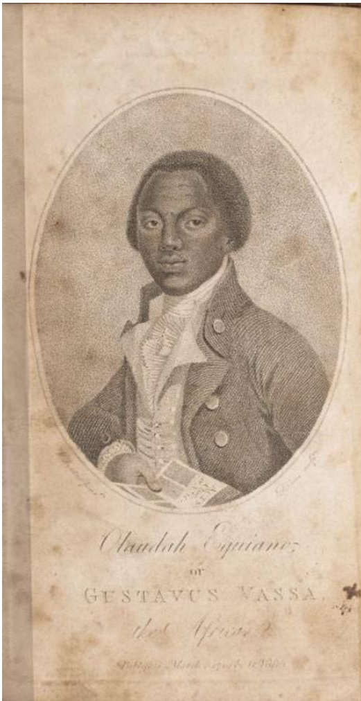
Portrait of Olaudah Equiano with a book in hand.

Unknown creator. Published in Olaudah Equiano, The Interesting Narrative of the Life of Olaudah Equiano, or Gustavus Vassa, the African (London: printed and sold by the author, 1789).