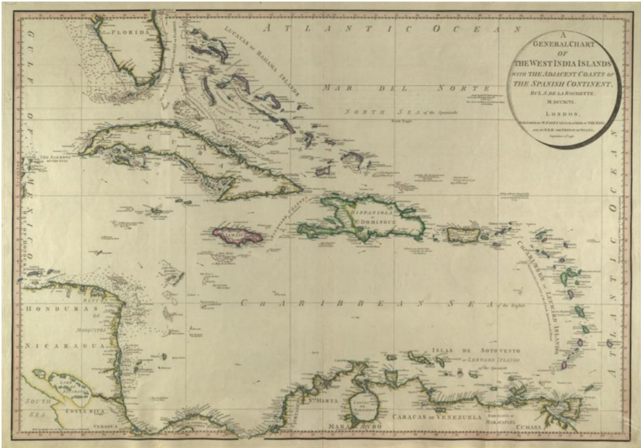
Map of the West Indies, an area of Equiano’s enslavement.

literal and the metaphysical, Equiano hinted that the mission engendered celestial retribution. On another day, he almost drowned, only to be “providentially” saved by shipmates. Similar to his earlier misfortune, Equiano straddled between life and death, salvation and damnation. By elevating these trials of severe heat and cold to almost Biblical allegories of punishment, Equiano signaled disapproval for the expedition.