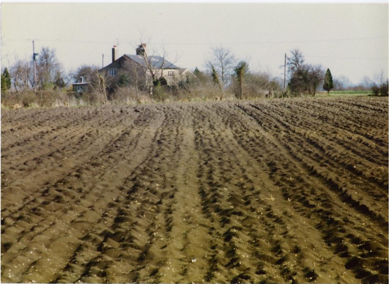
Tilled peat fields in the fens, n.d.

Reflecting both the incursions of tidal flooding and landlord's enclosure of open marshland, this dialectical articulation of "his & nature's expropriation" frames access to the commons as a struggle over the means of social reproduction . In the same year that The East Anglia Sequence appeared in print, Silvia Federici had published her seminal account of enclosure enabling "the appropriation and concealment of women's labor" as processes external to value-producing work. Following the loss of collective subsistence and gleaning rights afforded by the common, Federici argued, reproductive labor was confined and reorganized around the domestic sphere. As Mulford has it, the history of enclosure is also "the history of the family."