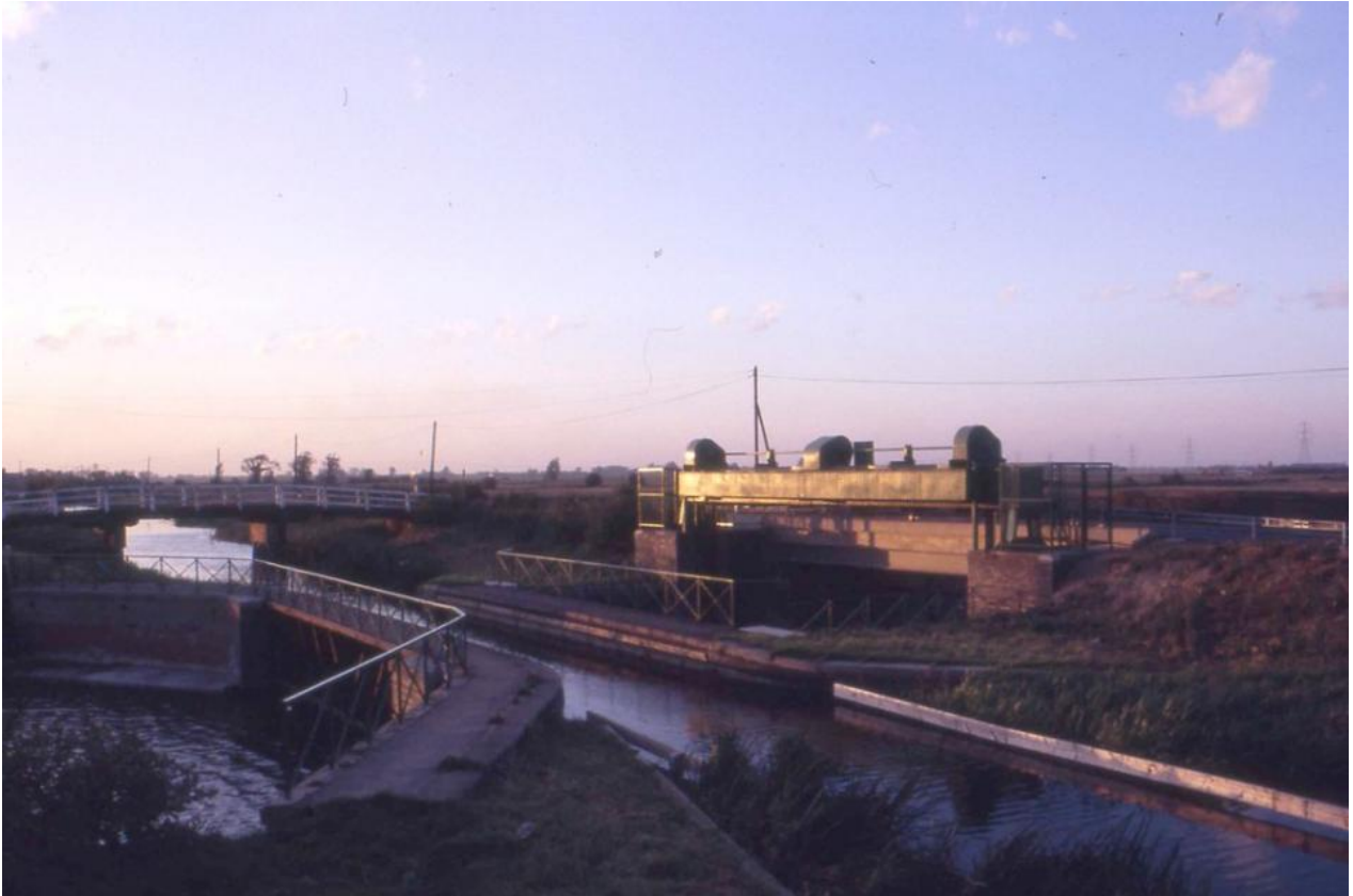
Aqueducts and pumping stations form a latticework of drainage infrastructure in the fens, 1993.

Photo by Sludge G, 2009, on Flickr. Click here to view the source.