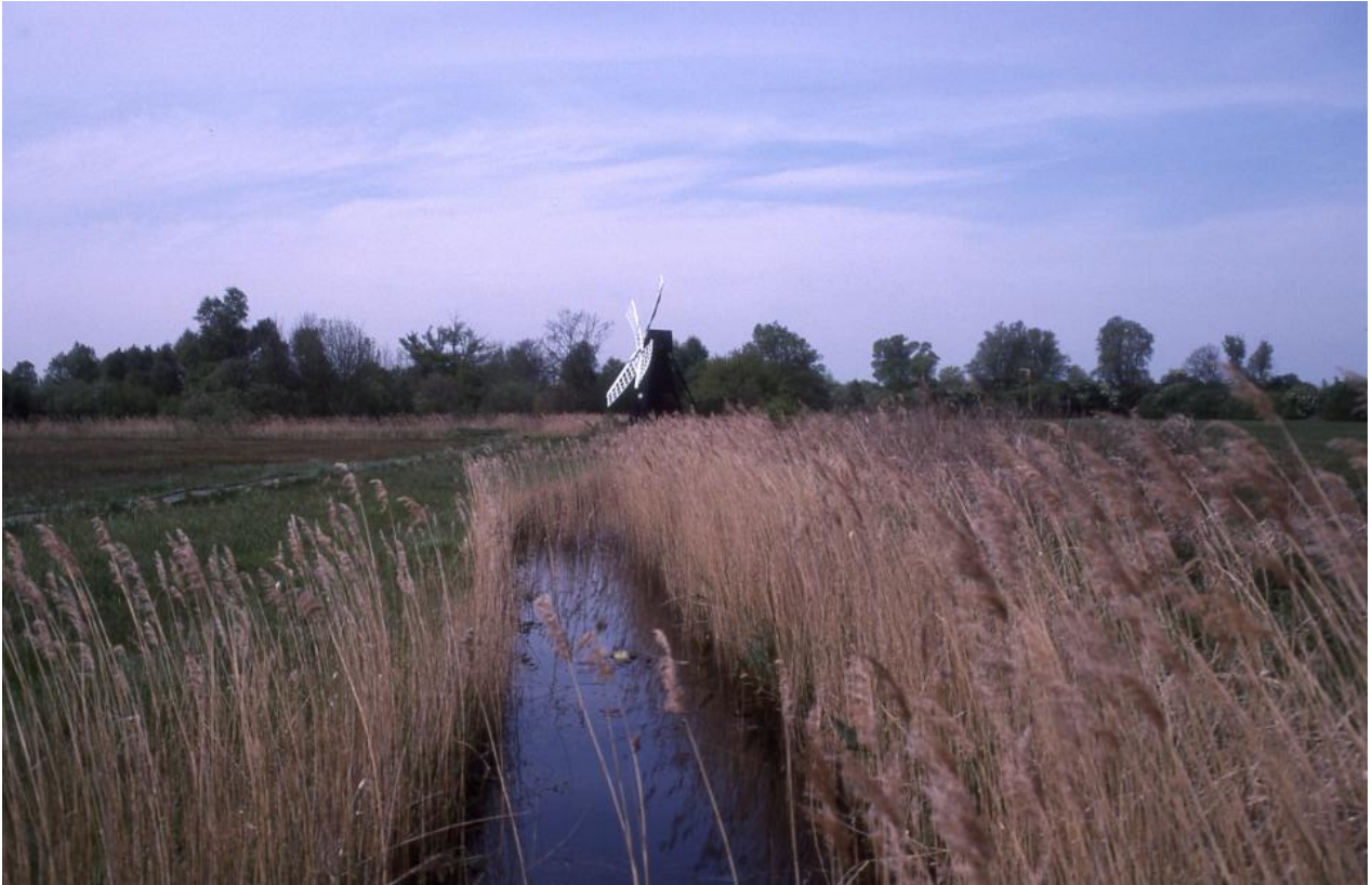
A drainage ditch and wind-powered pumping station, East Anglia, n.d.