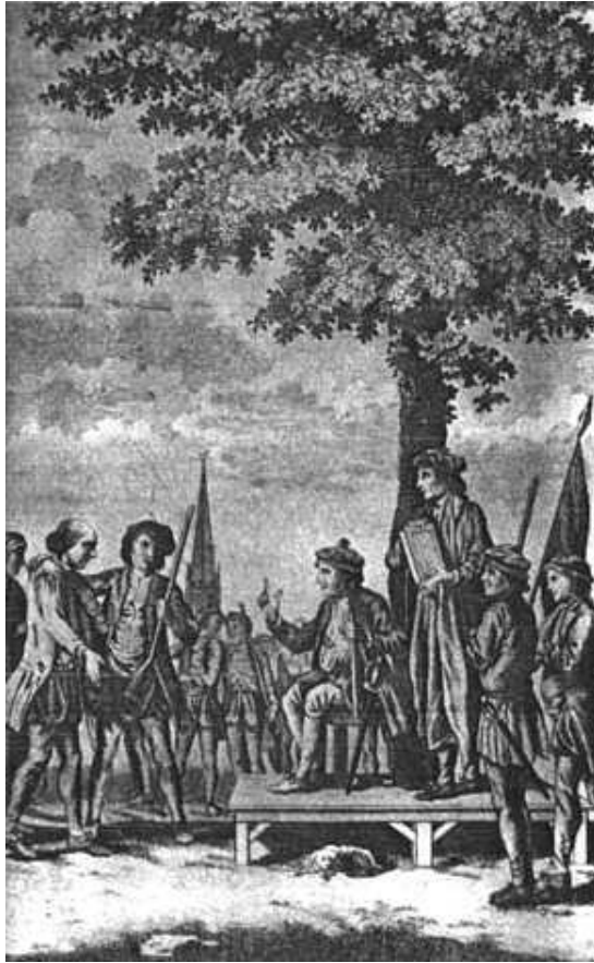
Kett's Rebellion of 1549, Norfolk. Engraving by Samuel Wale, 1785.