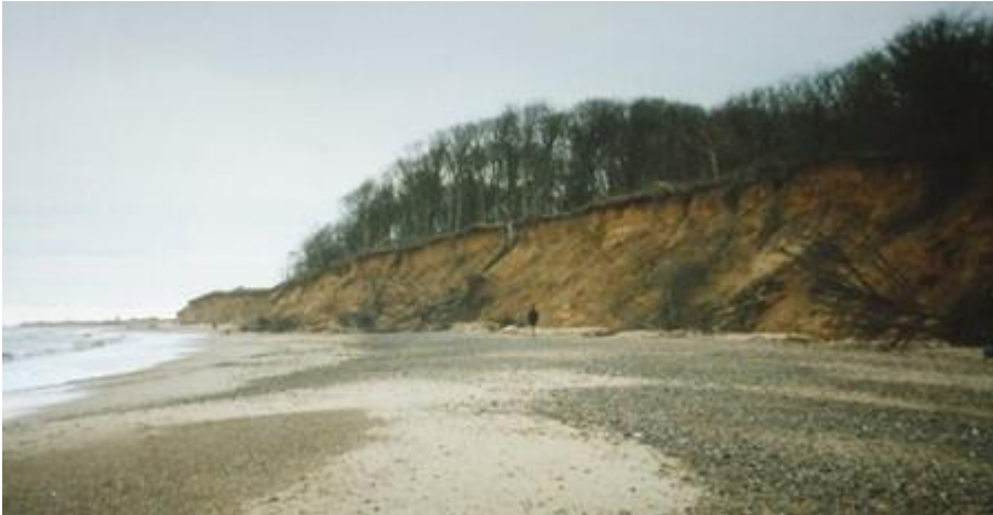
Coastal erosion in Suffolk, UK.