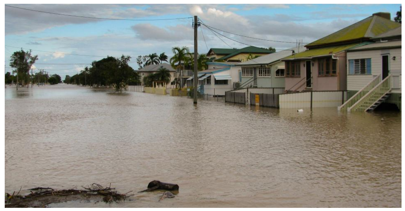
The Fitzroy River in flood at Rockhampton, 2017.

The Fitzroy River sits in the largest drainage basin that flows to the east coast of Australia—and it can be a coffeecolored maelstrom in times of flood. In late March 2017, Tropical Cyclone Debbie wandered inland and soaked the upper reaches of the massive catchment. It took a whole week for the upstream deluge to rush through the regional city of Rockhampton and career coastward to smother the southern end of the Great Barrier Reef with its burden of sludge.