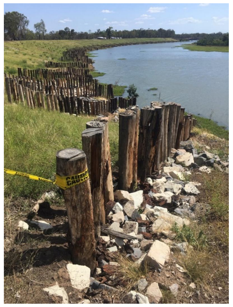
Fitzroy Basin Association Site 7 on the Fitzroy River near Rockhampton, Australia, 2019.

In the Anthropocene, the floodplain is where we plant infrastructure—to eat, sleep, work, and play. Riverbank shape-shifting has thus become highly unwelcome—for both rivers and humanity! Arguably, if there were no landholdings on the floodplain, there would be no need to manage riverbanks.