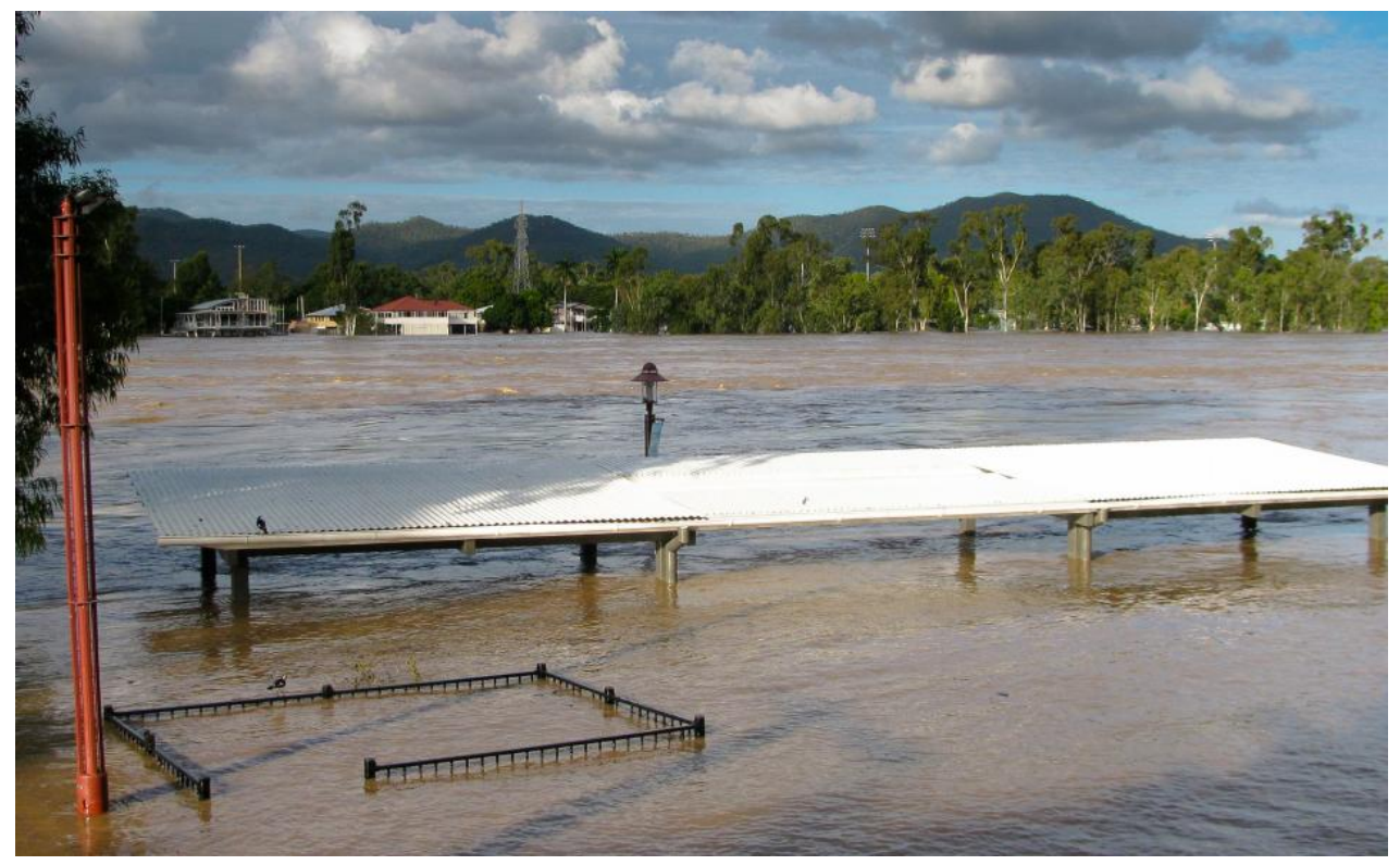
The Fitzroy River in flood at Rockhampton, 2017.

And secondly, upstream land care in which the connectivity and ecology of a river system are holistically recognized could be practiced—not just some de-sludging to treat the symptoms of a larger issue. Much can be learned from expressions of legal and policy rights for rivers in South America, Canada, India, and other places.