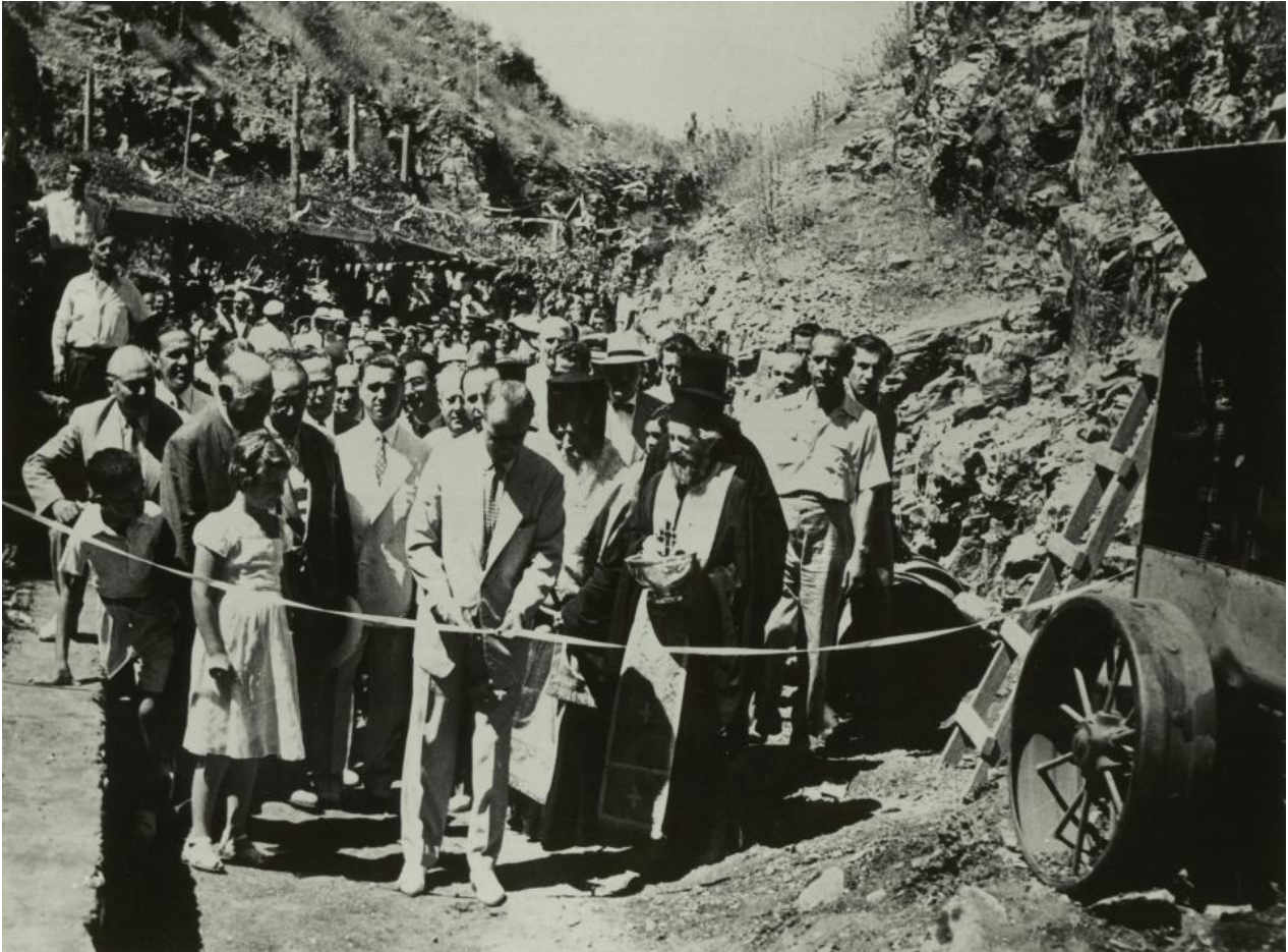
The minister of public works, Konstantinos Karamanlis, inaugurates the commencement of the drainage works in Lapsista, 2 August 1954.

© Christos Anastasiou. All rights reserved. Courtesy of the “Konstantinos G. Karamanlis” Foundation.