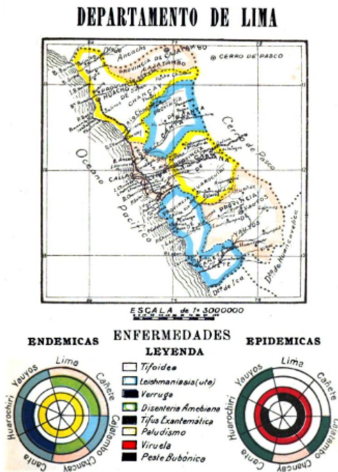
Map of the main pathologies of the Department of Lima, 1925.