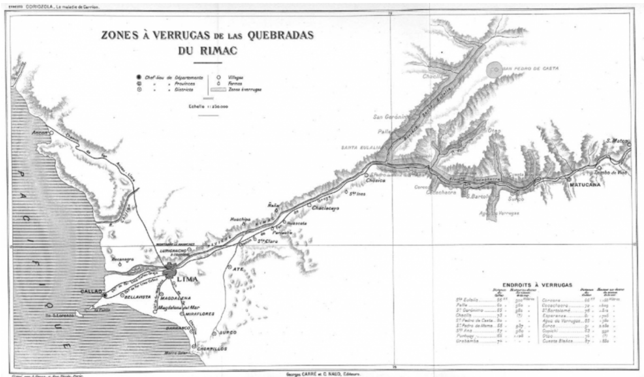
Fig. 1. Zones of verrugas in the Quebradas of Rimac, 1898.

Originally published in Ernesto Odriozola, La Maladie de Carrion, ou la Verruga péruvienne (Paris: G. Carré et C. Naud, 1898).