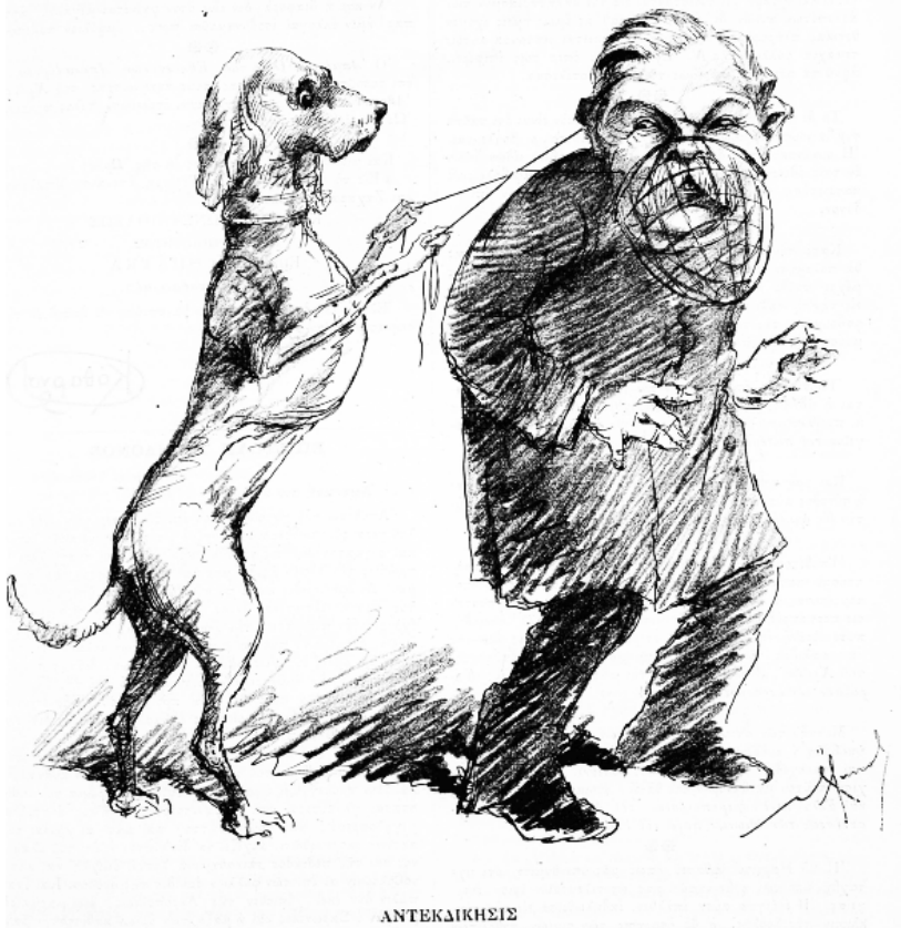
Comic strip titled “Counter-revenge,” showing a dog putting a muzzle on the minister of the interior, Nikolaos Papamichalopoulos ( To Asty , 23 March 1886).