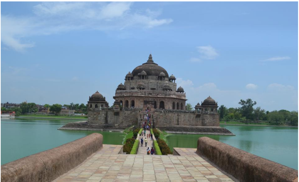
Photo of Sher Shah's mausoleum in Sasaram, the place where he was born.

Examining the impact of ecological and geographical features on the configuration of political space within a region adds a compelling dimension to historical inquiry. A noteworthy case study is the transformation of Bihar, situated in the riverine landscape of the mid-Ganga basin in South Asia, into a distinct province in the sixteenth century. This case study illustrates the intricate interplay between geography and the political constructs that define a region.