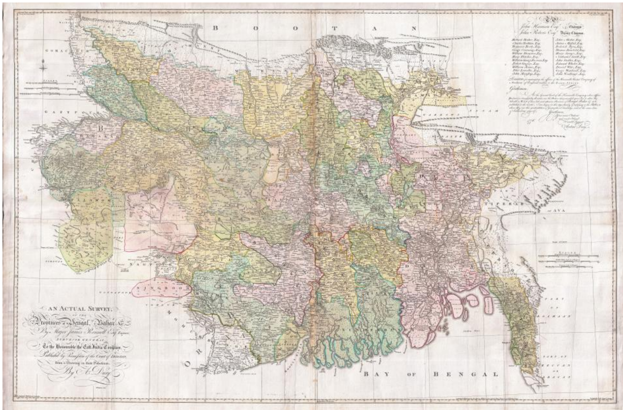
James Rennell's Map of Bihar and Bengal in 1776. It is one of the first accurate maps laid out from primary surveys done by James Rennell after the East India Company got the revenue collection rights of Bihar, Bengal, and Orissa from the Mughals.

Bihar province was organized into seven administrative districts known as sarkars. The demarcation of these districts was heavily influenced by the region's prominent rivers, underscoring the pivotal role of geography in the administrative structure of the time. Each district was linked to a specific river floodplain, contributing to its high agricultural productivity. Mughal rulers appointed distinct revenue officers, therefore, to oversee revenue collection in each district. The river channels served as conduits for internal trade and grain exports. The Ganga River, with its navigable routes and extensive connectivity to all districts, played a pivotal role in facilitating the transportation of goods, enhancing the region's economic activities and trade networks.