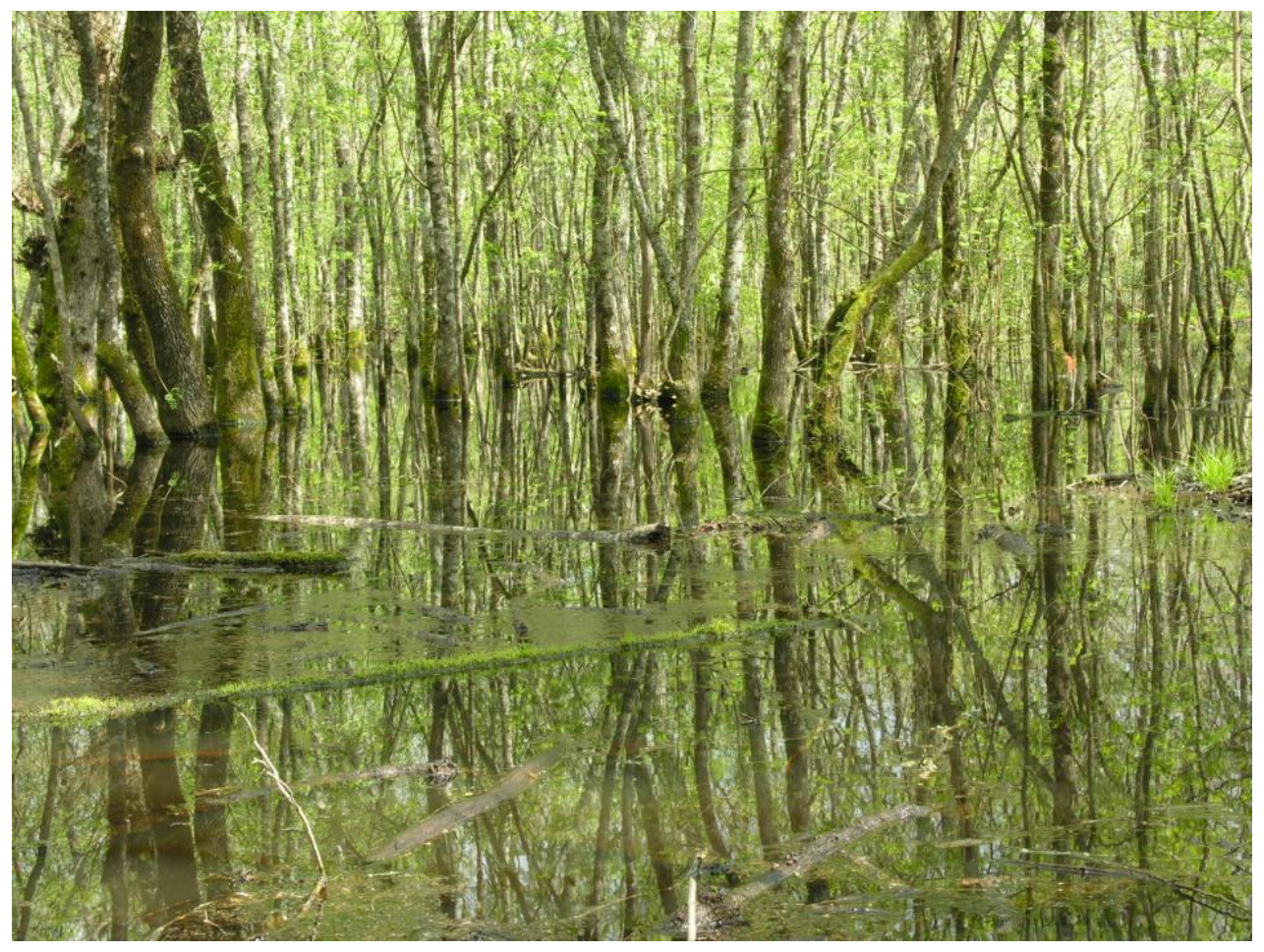
The remaining swamps within the Circeo National Park