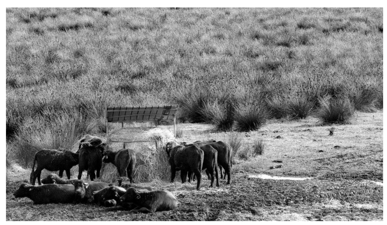
Water buffalos in the Circeo National Park