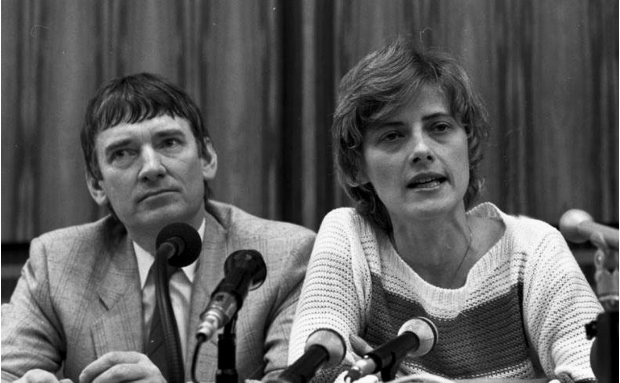
Petra Kelly at the press conference of the West German Greens (together with Otto Schily) after the party's first election into the Bundestag (1983)