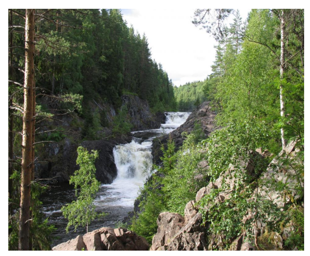
Photo of the Kivach waterfall showing the enormous transformation of stream and landscape after the construction of the Girvas dam (2008)

EXERCISED ON ANNI This work is licensed under a Creative Commons Public Domain Mark 1.0 License .