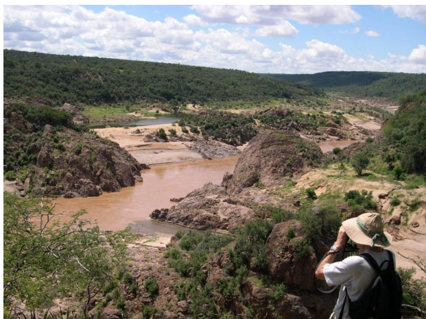
View of Olifants River Gorge in Kruger National Park