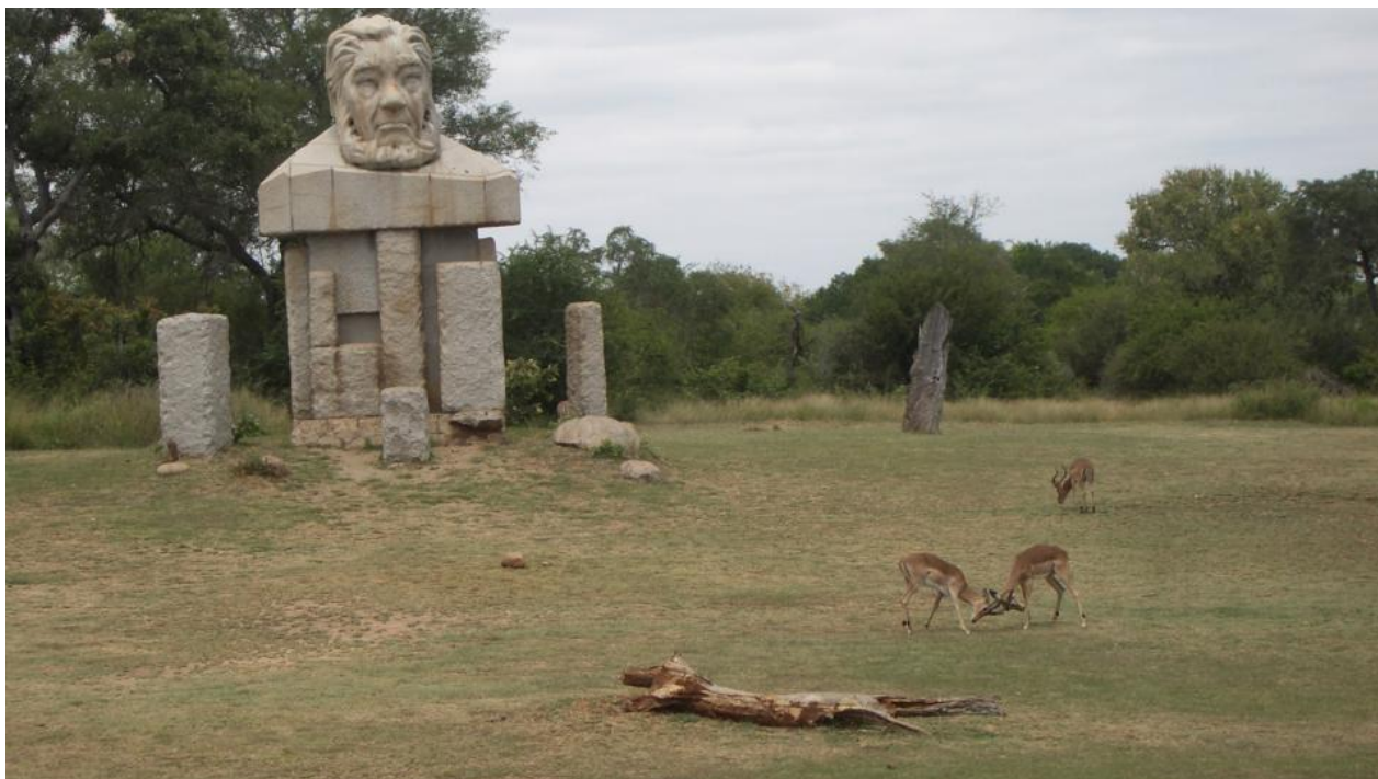
Bust of Paul Kruger, President of the Transvaal Republic 1883-1902, after whom the Kruger National Park is named