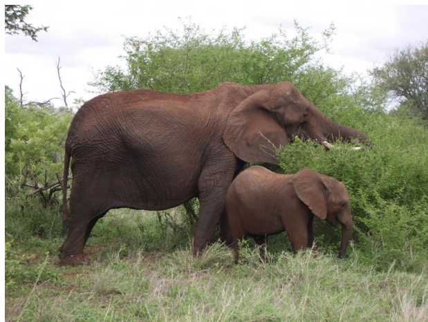
In 1902 there were no elephant in the area of the Kruger National Park. There are now over 15 000.