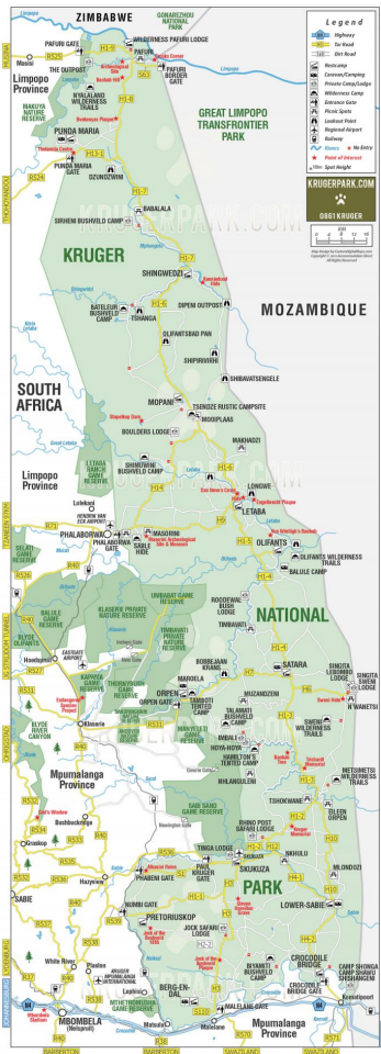
Map of Kruger National Park

Courtesy of Kruger National Park. For more information please visit the website of the park. View source .