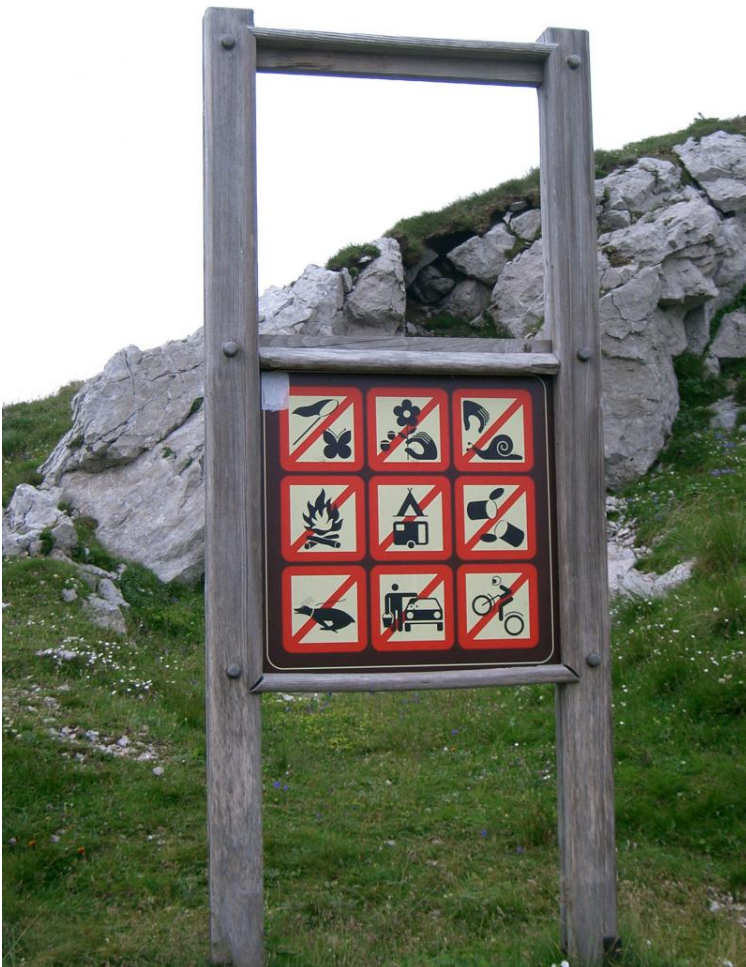
"Forbidden" – a rather traditional sign in the Triglav National Park on Mangart Pass, the highest mountain pass in Slovenia.

of natural monuments worth protecting. Among others, he proposed setting aside the Valley of the Seven Lakes below the Triglav, which he deemed of interest for science and, due to its low economic value, easy to protect. Nevertheless, concrete protective measures were not established until after the Yugoslav monarchy succeeded the Habsburg reign. In 1924, the conservationists of the Museum Society's Department for Nature Protection in Ljubljana and the Slovenian Alpine Club signed a lease agreement with the Forest Directorate which set aside the Valley of the Seven Lakes with the understanding that all institutions involved would support the project of the "Alpine Protection Park." However, enforcement of conservation measures was poor. Peasants insisted on their usage rights of the pastures, and tourists, too, were all too often inclined to walk off the beaten tracks.