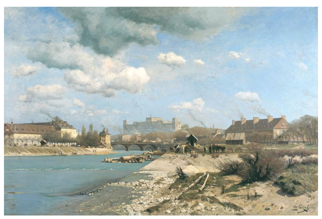
Wharf on Munich's Kohleninsel (Otto Strützel 1889)