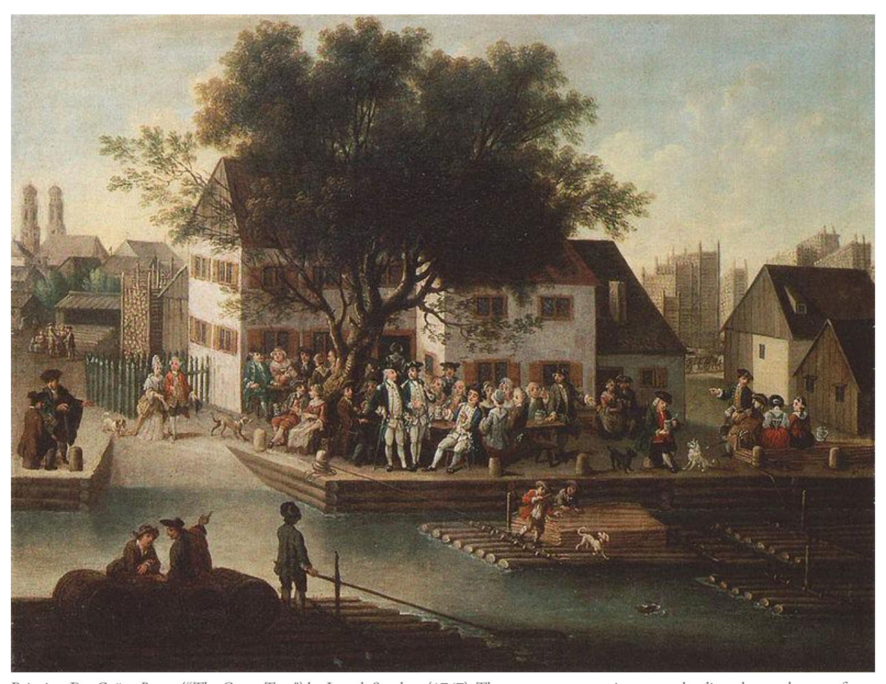
Painting Der Grüne Baum ("The Green Tree") by Joseph Stephan (1767). The green tree was an important landing place and name of a pub on Munich's raft port.

All rights reserved © 1767 Joseph Stephan. Courtesy of Deutsches Museum - Bildarchiv