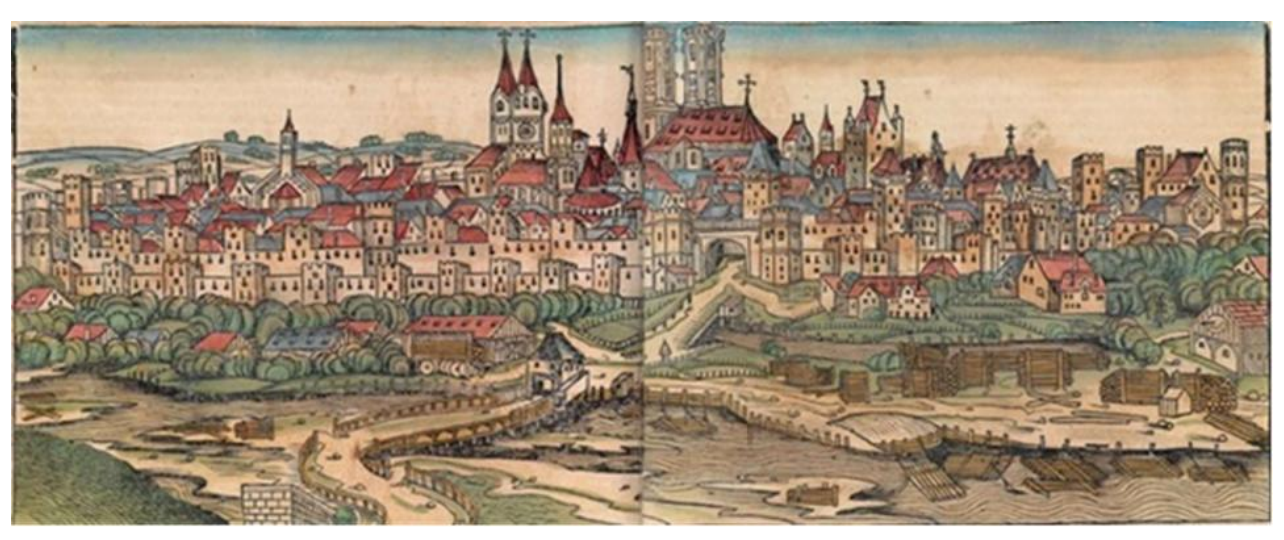
Panorama of Munich in Schedel's Weltchronik (known as the Nuremberg Chronicle) with rafts in the foreground (1493)