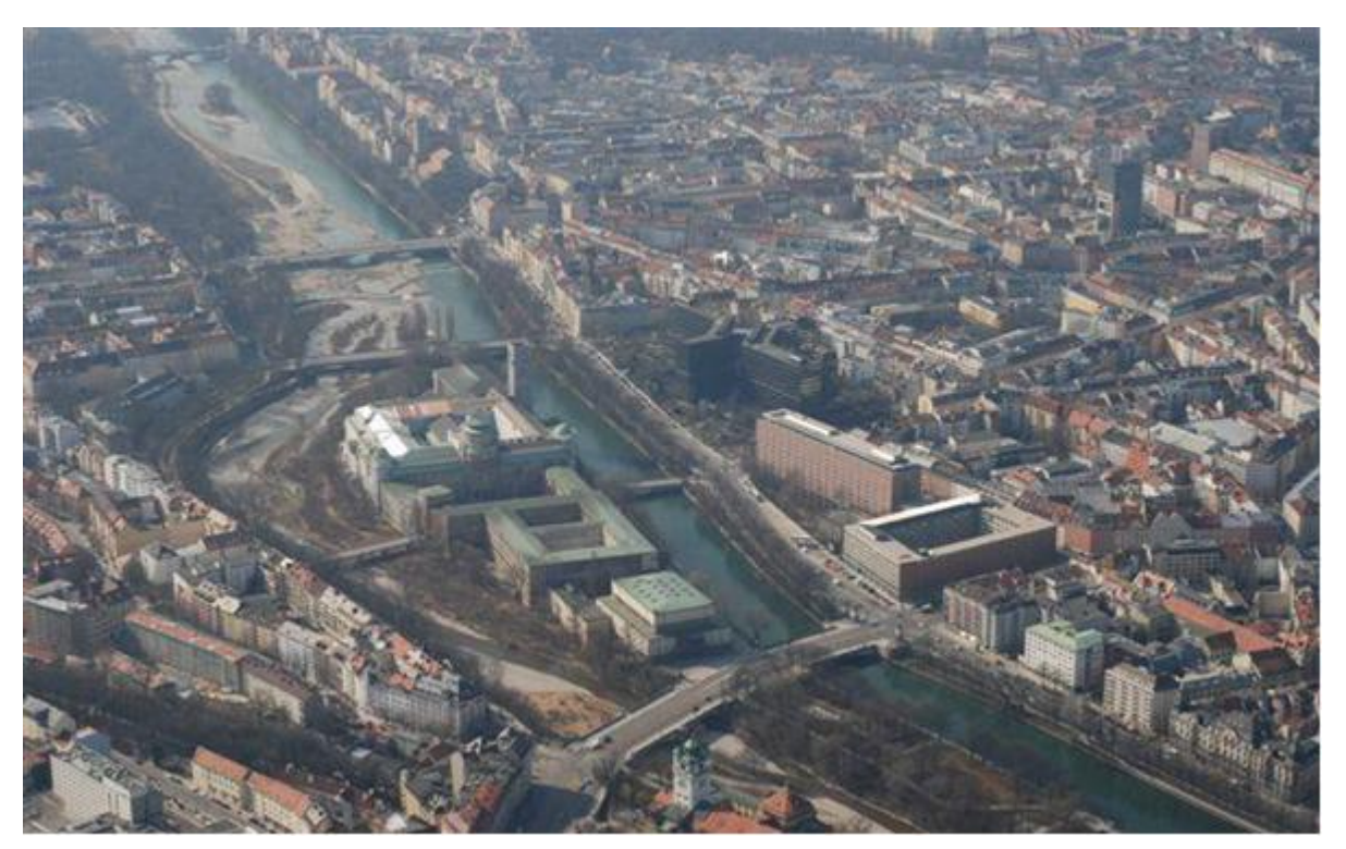
The Kohleninsel ("coal island"), used to be part of Munich's raft port. Today it has been renamed the Museumsinsel and is the site of the Deutsches Museum (2011).