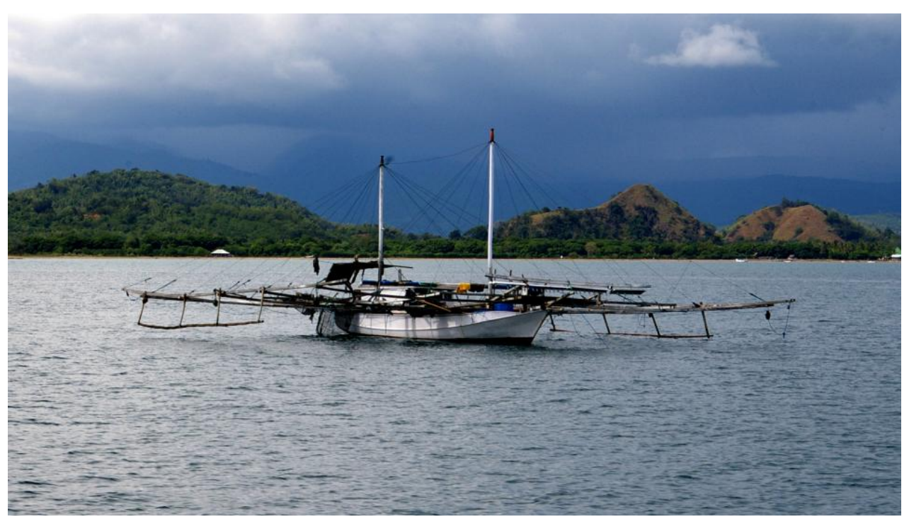
Local fisherboat at Labuan Bajo harbor on Komodo