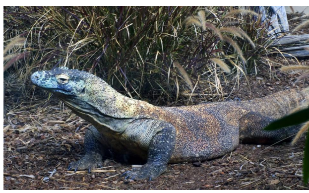
"Komodo Dragon" (2008)

This work is licensed under a Creative Commons Public Domain Mark 1.0 License.