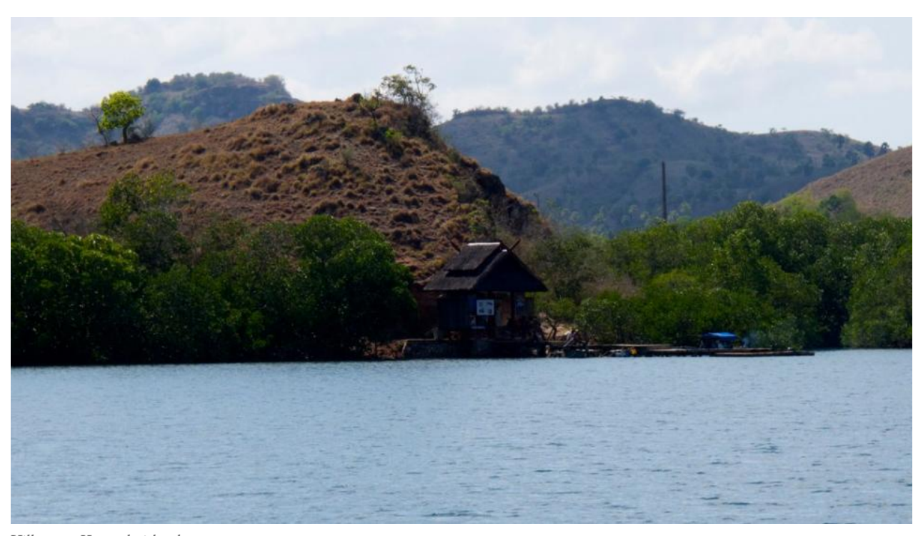
Village on Komodo island