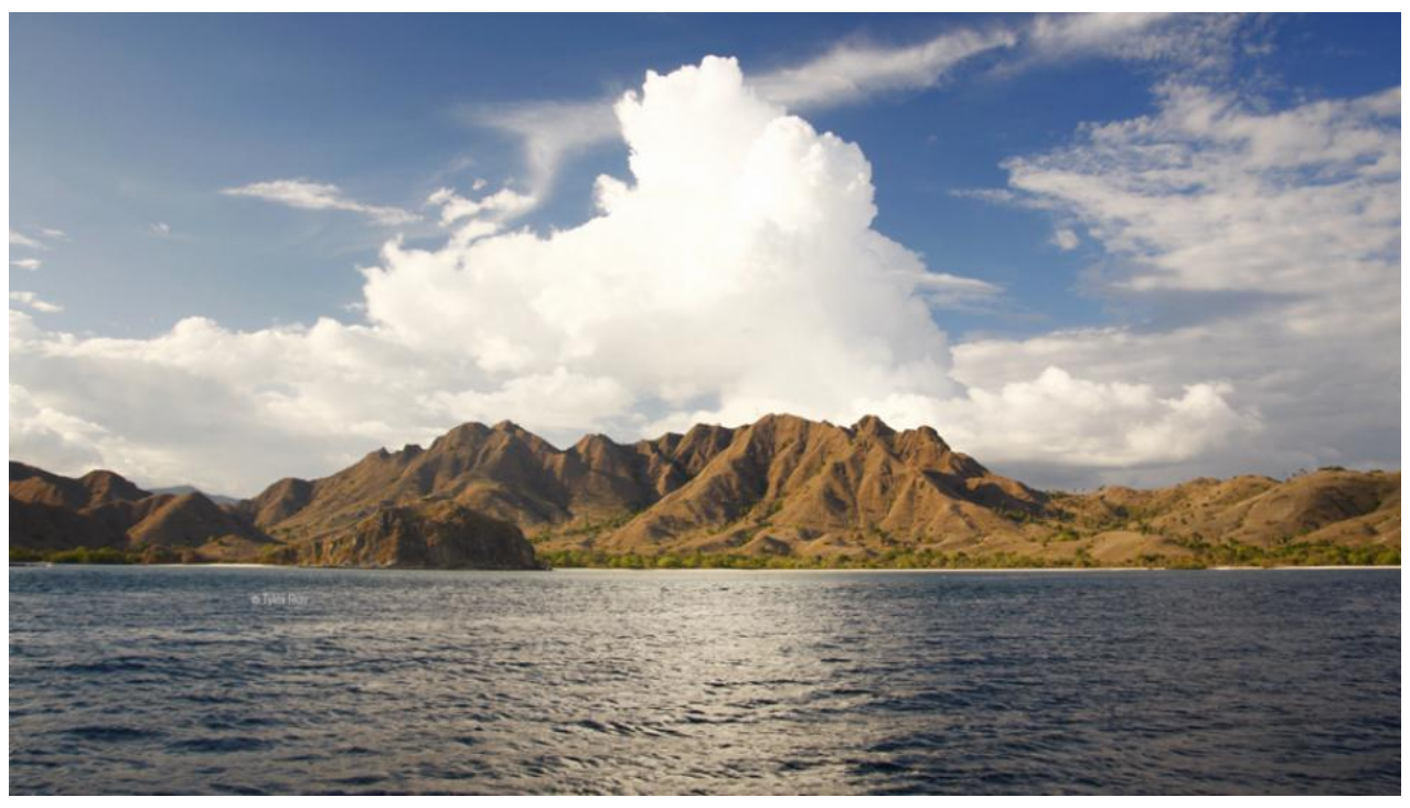
Komodo National Park from seaside