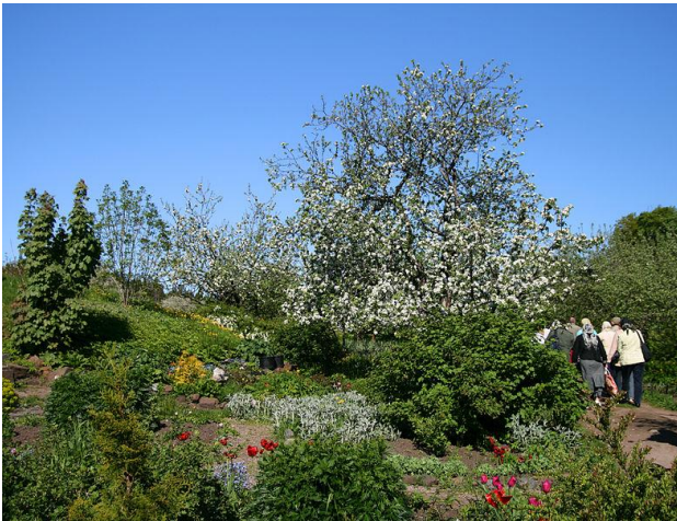
View from lower gardens

Medicinal herbs were grown here, including rose hips, valerian, juniper, and mint.