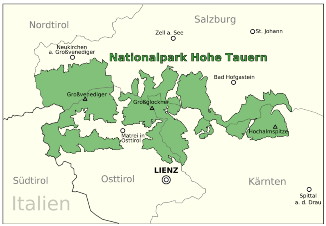
Map of the Hohe Tauern National Park

Besides the upheavals caused by war, harmonizing (or deflecting) social interests was the main reason for the time-consuming process of achieving the designation of the national park. Bringing proponents and opponents closer together and mediating between local needs and international standards took many very small steps. Hardly any other national park featured as many land owners who needed to be convinced of the significance and benefits of such a project. A 1995 mission statement called it "a miracle of spatial planning and conservation." This miracle did not come about through divine or human intervention but was the result of endless talks and of mobilizing new sources of income for the region.