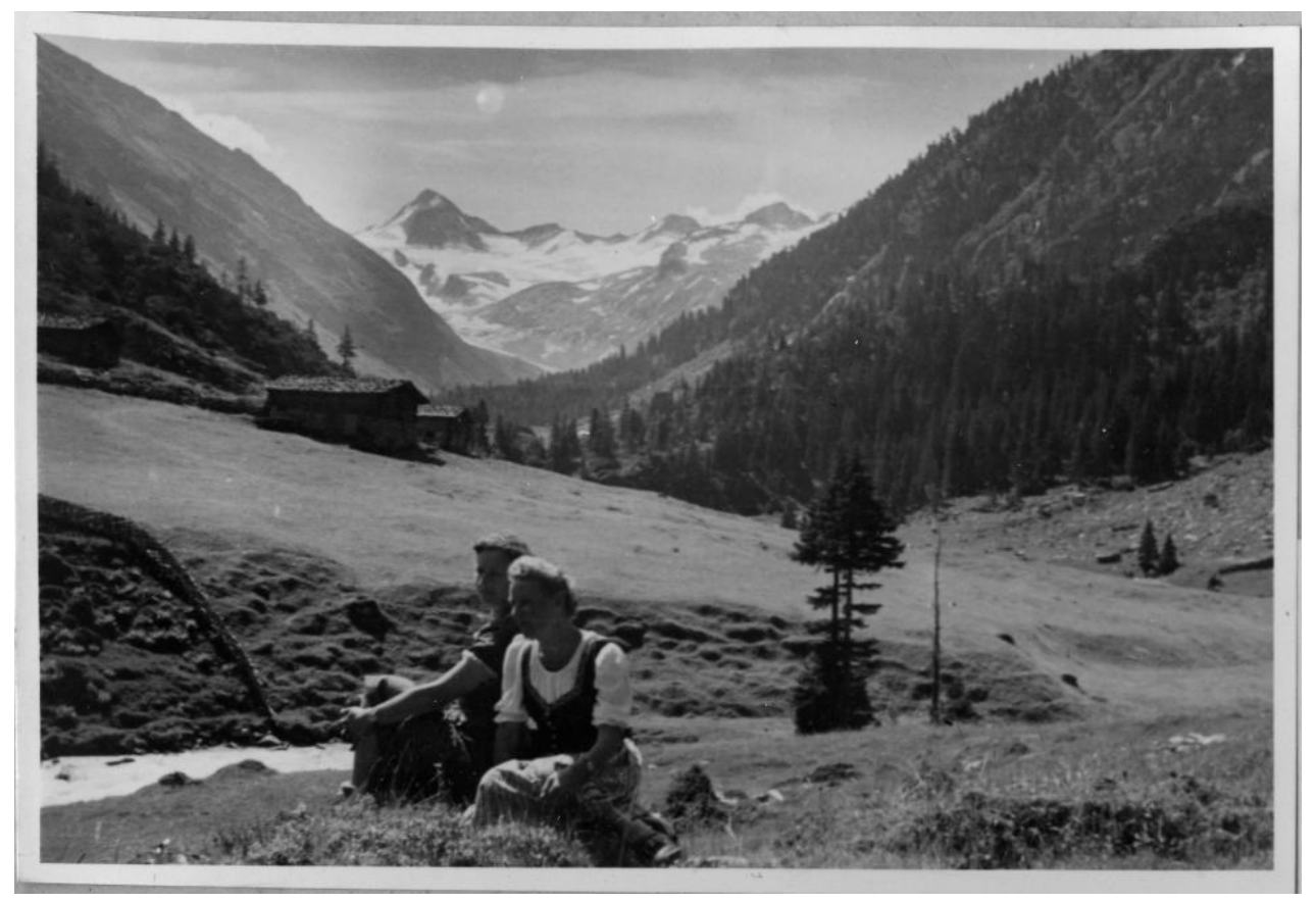
Postwar nature idyll: The "Musteralm" Schidhofalm in the Obersulzbachtal, photographed by leading Austrian conservationist Lothar Machura (1950)

All rights reserved © 1950 Lothar Machura, Verein Naturschutzpark