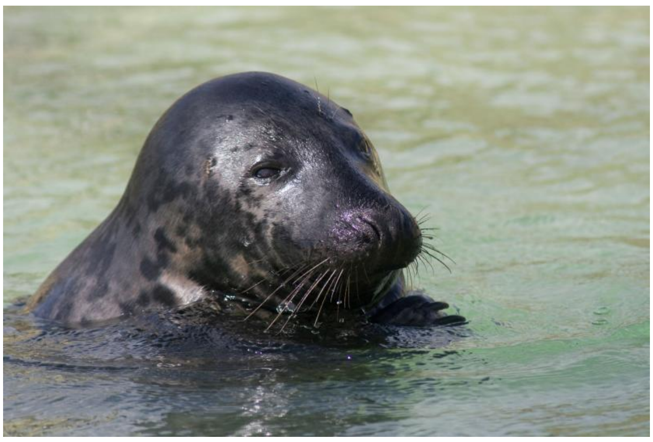
Ignorant of borders: The grey seal, extinct for centuries, returned to the Wadden Sea in 2007.

Slowly capacity and regime building processes began. In 1965 the interdisciplinary International Wadden Sea Working Group was formed to coordinate the research and collect data; in 1978 the three nations involved pursued a common conservation policy; in 1982 a Joint Declaration was signed; and in 1987 a common secretariat established in Wilhelmshaven (Germany).