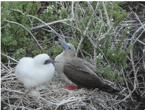
This picture was taken in Punta Pitt in San Cristóbal Island one of the largest colony of red-footed boobies in the Galapagos Islands. The image represents a chick being fed by its mother.

Conservationist efforts concerning the Galapagos became more concrete in the 1950s, when prominent scientists, such as Julian Huxley and international organizations such as the IUCN and UNESCO, promoted an ecological approach to international nature conservation and accorded top priority to the preservation of the Islands' flora and fauna. In 1957, UNESCO and IUCN jointly commissioned German ethologist Irenäus Eibl-Eibesfeldt and American biologist Robert I. Bowman to the archipelago in order to assess the situation and identify a suitable site for a scientific research station. Media coverage by the illustrated Life Magazine , which accompanied the expedition in the run-up to the upcoming centennial of Darwin's "On the Origin of Species," raised international public awareness of the urgent need for effective protection of "Darwin's living laboratory of evolution."