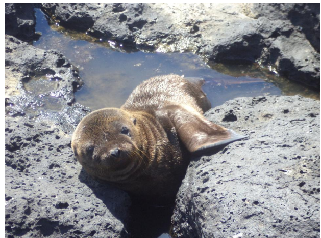
This is a puppy born on the breeding season 2013 on the islet Caamaño, Galapagos Islands. The puppy is around 1 month old.

This work is used by permission of the copyright holder.