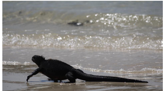
Iguana at the coast, Galapagos Islands.

This work is used by permission of the copyright holder.