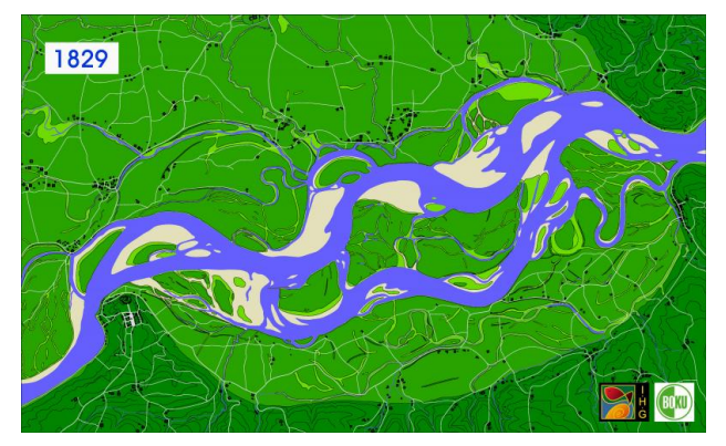
Danube in Machland (1829)

The Machland prior to the excavation of the shipping channel trough the Weidenhaufen Island in 1829.