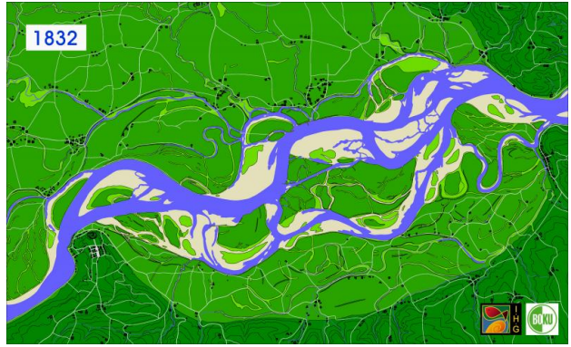
Danube in Machland (1832)

The copyright holder reserves, or holds for their own use, all the rights provided by copyright law, such as distribution, performance, and creation of derivative works.