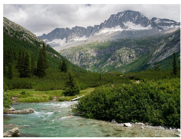
The Val di Fumo, a core area of the Adamello Brenta Nature Park

political commitment and funding issues thwarted the development of a park. As a result, the Adamello Brenta Nature Park was only formally instituted in 1967, and did not become fully operational until the late 1980s.