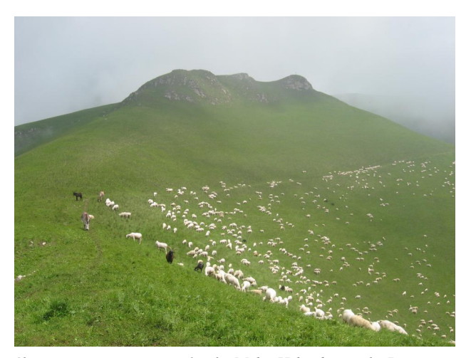
Sheep grazing on a pasture by the Malga Valandro on the Brenta massif

This work is licensed under a Creative Commons Attribution-NonCommercial-ShareAlike 2.0 Generic License.