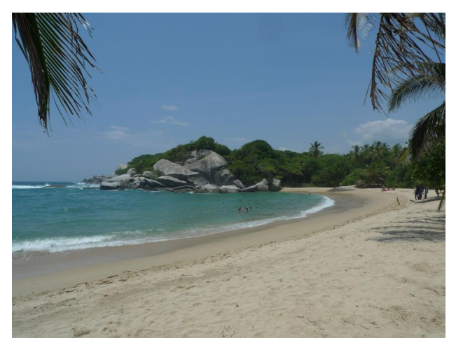
Beach at Cabo San Lucas, Tayrona National Park