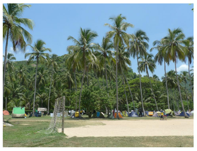
Camping site at Cabo San Lucas

This work is licensed under a Creative Commons Attribution-NonCommercial-ShareAlike 4.0 International License