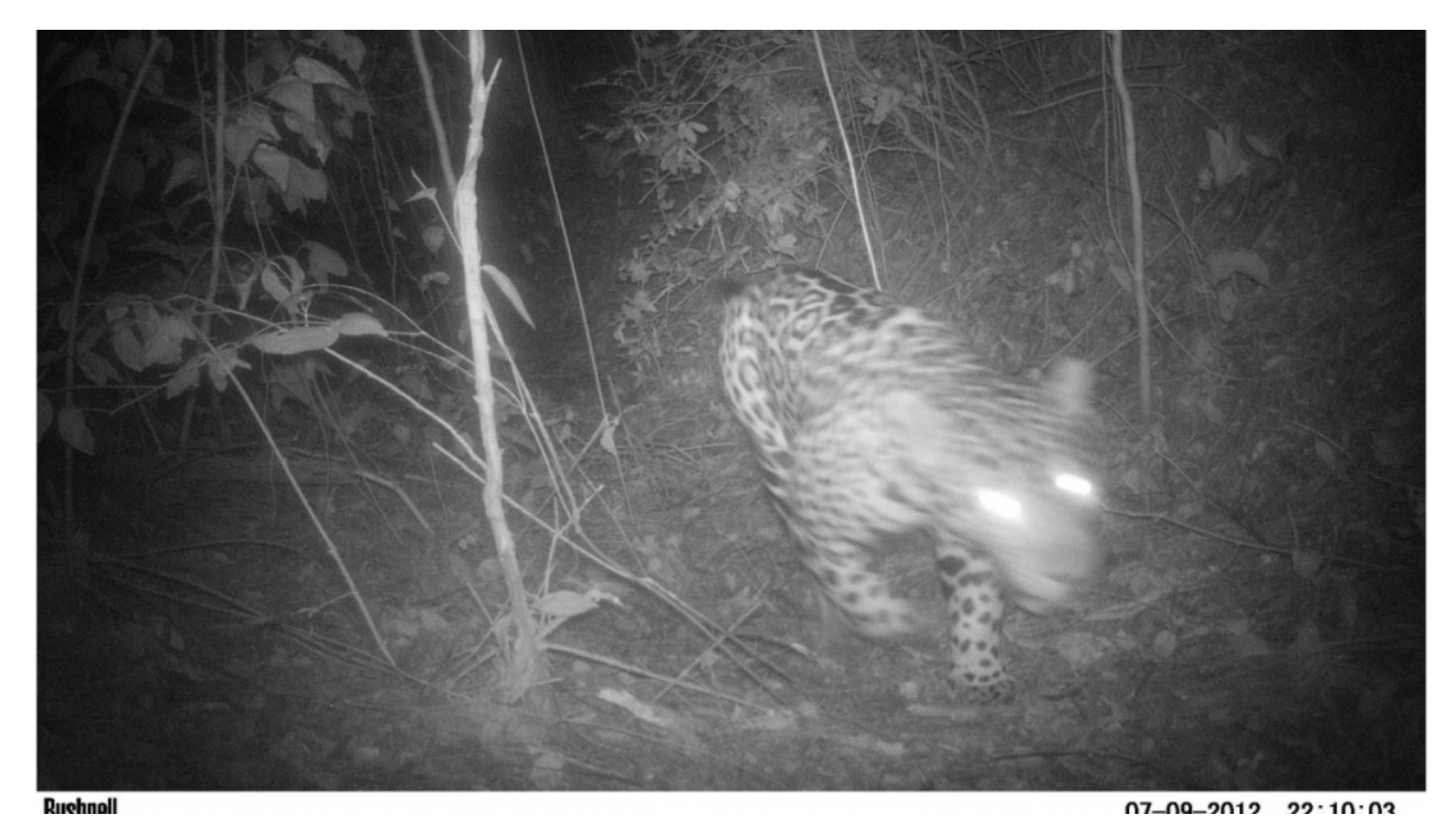
Jaguar (Panthera onca ), Chengue, Tayrona National Park

Camera trap photograph, 2012; Archivo Parques Nacionales de Colombia.