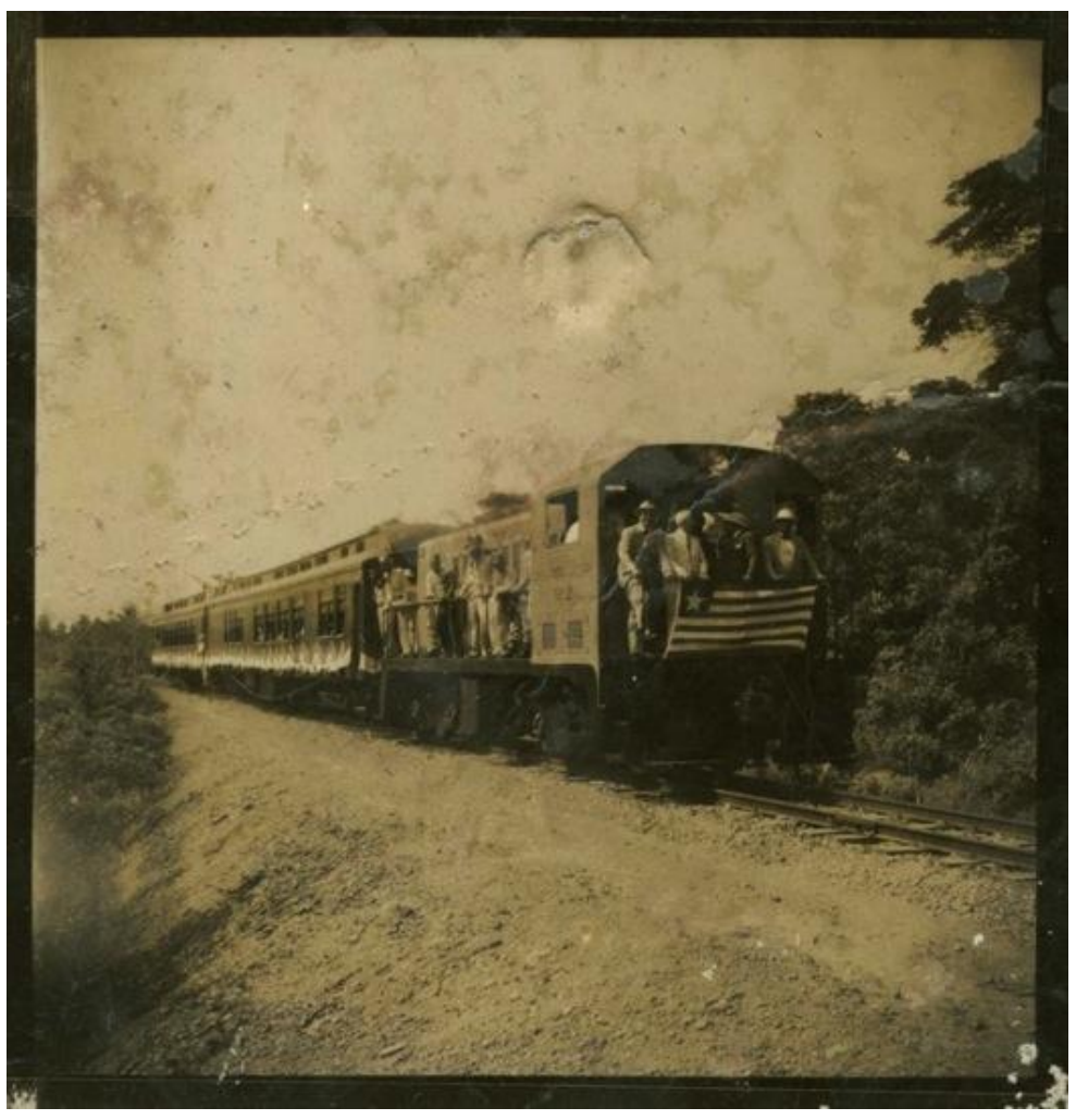
Inaugural train ride at the dedication of the Antoinette Tubman railroad bridge