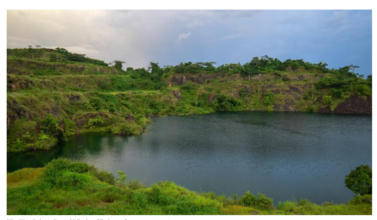
The Blue Lake in Bomi Hills that filled up a former mining pit