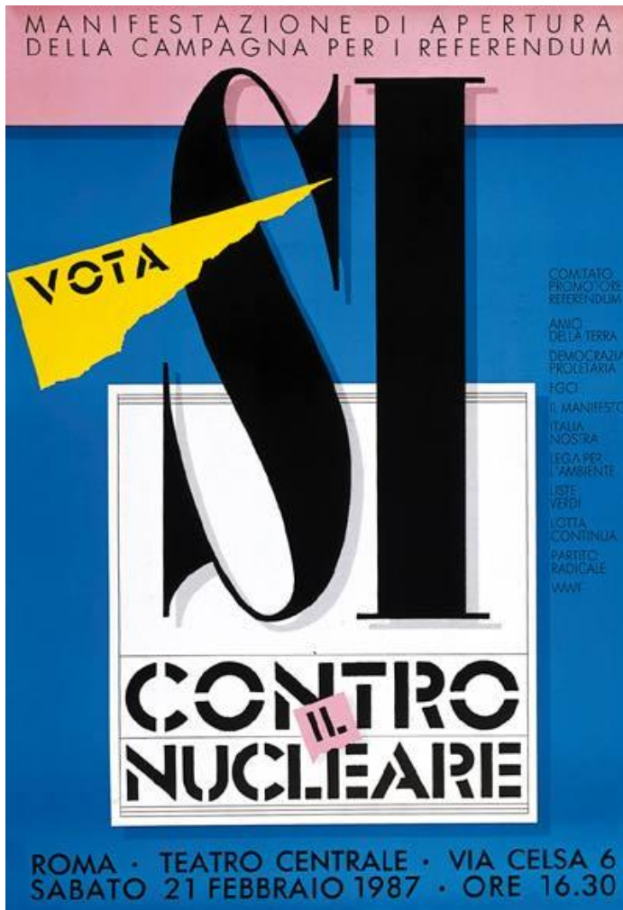
Manifesto of the opening event of the referendum campaign

About 65% of those eligible to vote did so. A majority of 80% voted in favour of the abolition of statutes and a rewards system that enabled and supported the construction of new nuclear plants. In the face of such massive opposition to nuclear power, the government even blocked the construction of nuclear plants that had already been approved and wound down plants then in use. Calls for a referendum on nuclear power had already been made at the end of the 1970s by, among others, the small but militant Radical Party.