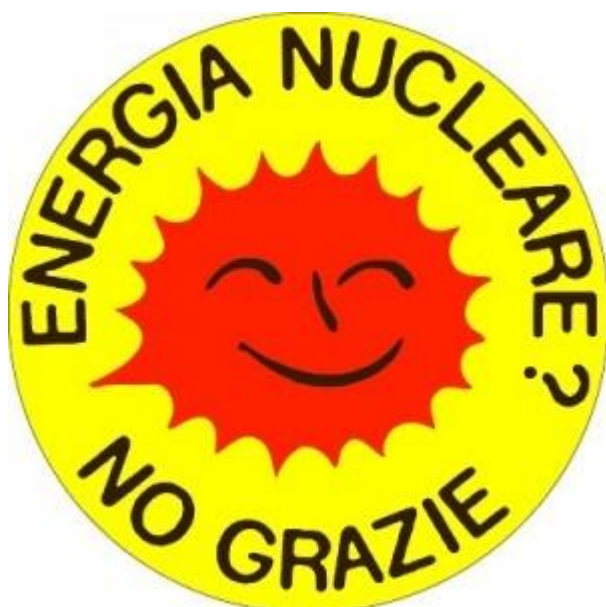
Italian anti-nuclear logo "Nucleare No Grazie!"