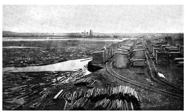
Hough also noticed a decrease in lumber production in New York and wondered how long forest supplies would last.

This work is used by permission of the copyright holder.