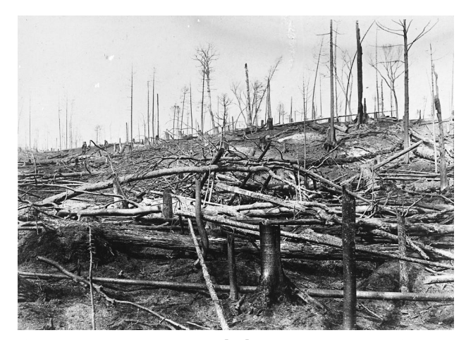
"There is no subject in Forestry [sic] more important than the prevention and control of forest fires," Hough wrote in 1882, the same year he published data on wildland fires nationwide.

In his 1873 paper "On the Duty of Governments in the Preservation of Forests," presented to the American Association for the Advancement of Science (AAAS), Hough warned that deforestation threatened the nation's waterways and future growth, and he called upon AAAS to petition Congress for the protection, cultivation, and regulation of forested lands. Congress responded in 1876, providing funds to investigate the condition of the nation's forested lands and to hire Hough as the nation's first forestry agent.