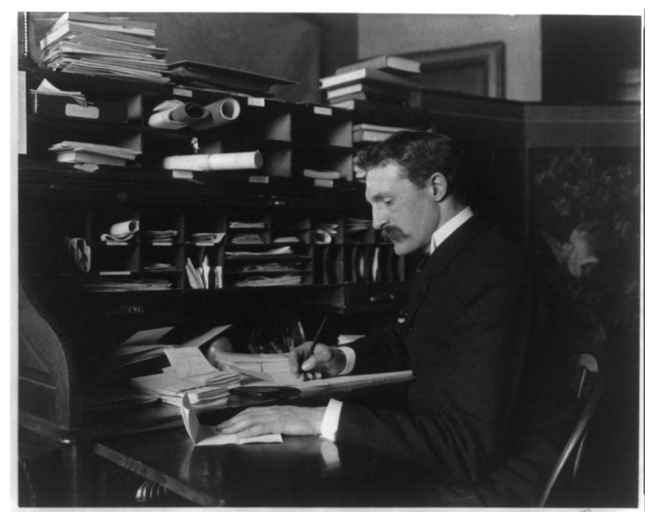
When Gifford Pinchot became chief of the Bureau of Forestry in 1898 and, later, the new USDA Forest Service in 1905, he hoped that investigations into wildland fires would lead to more effective methods of prevention and control nationwide.

Marsh, Powell, Sargent, and Hough raised awareness of the significant role played by the nation's forested lands, and of the importance of preventing and suppressing wildland fires. And yet, as noted in 1898 by Gifford Pinchot when he became chief of the Bureau of Forestry, little was known about forest fires and their effect on the composition and reproduction of forests. To address this need, Pinchot initiated a study of forest fires reported in American newspapers, and arranged for on-the-ground investigations of the extent, causes, and/or effects of fires in several states. As Pinchot would later write, he intended that "carefully gathered facts" should replace "the vague general notions that now exist about forest fires." While these investigations may not qualify as fundamental research by today's standards, these early studies laid the foundation for both the research and management policies that followed.