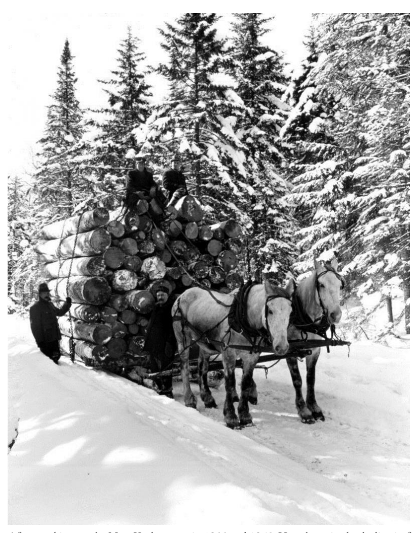
After working on the New York census in 1855 and 1865, Hough noticed a decline in forested lands and feared that excessive logging and deforestation would negatively impact the future growth of the nation.

Logging Sled in the Adirondacks Publisher: New York State Archives