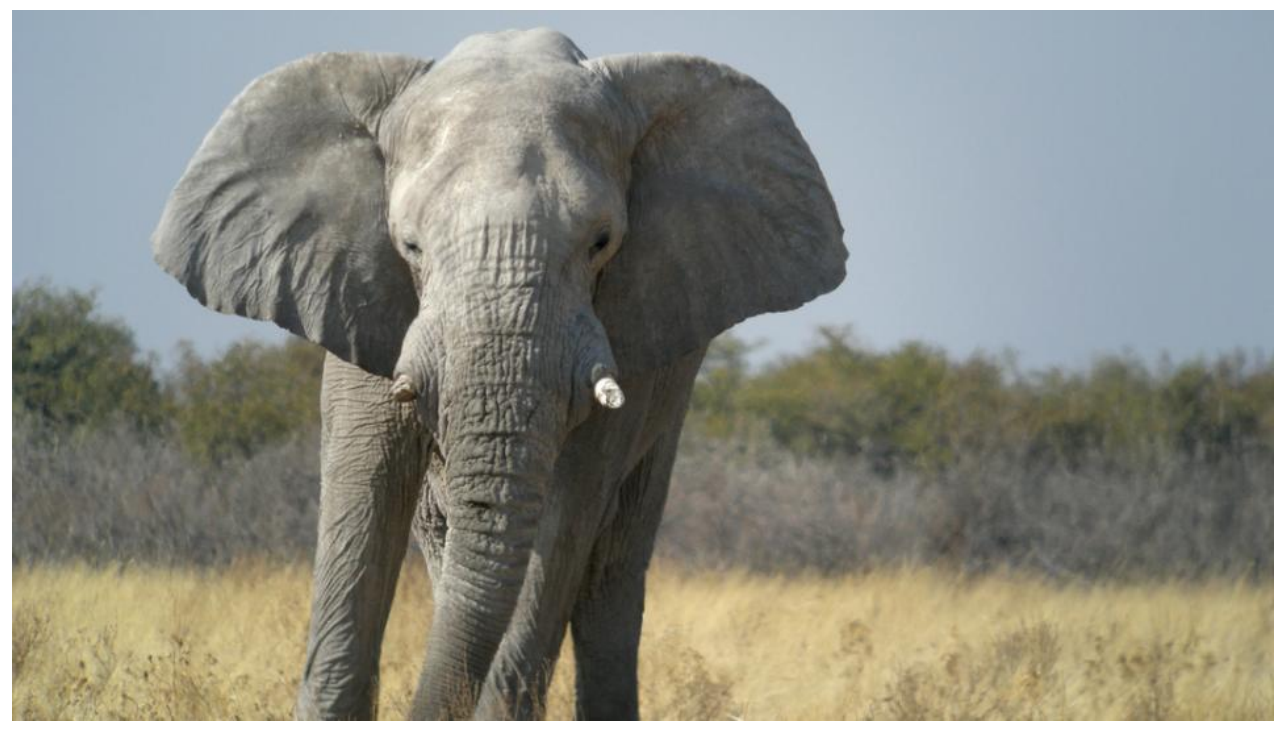
Elephant, Etosha National Park, Namibia

In general, colonial conservation policies and practices in Africa have been viewed positively with respect to their environmental impact in safeguarding Africa's fauna and flora, even as the objectives of the colonial administrations and their methods of preserving natural resources have been condemned as exploitative and destructive. Administrations used conservation to limit Africans' access to land, game, and other key commercial and subsistence resources to facilitate political control over subject populations and to force them into wage labor dependency. Colonial officials liberally employed force to protect flora and fauna and exacted draconian punishment to those caught breaking conservation regulations.