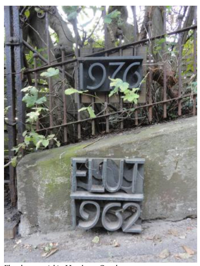
Flood memorial in Hamburg-Oevelgoenne

national memory culture. Elements of this "memory landscape" include speeches, memorials, high water marks, signs, newspaper articles, photographs, and films.