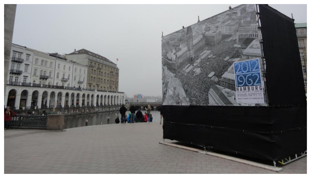
Temporary memorial during the 50th anniversary of the flood at Hamburg's Rathausmarkt

On 20 February 1962, some 150,000 people gathered on Hamburg's Rathausmarkt for a commemoration of the victims of the great flood that had inundated large parts of the city in the night of 16 and 17 February.