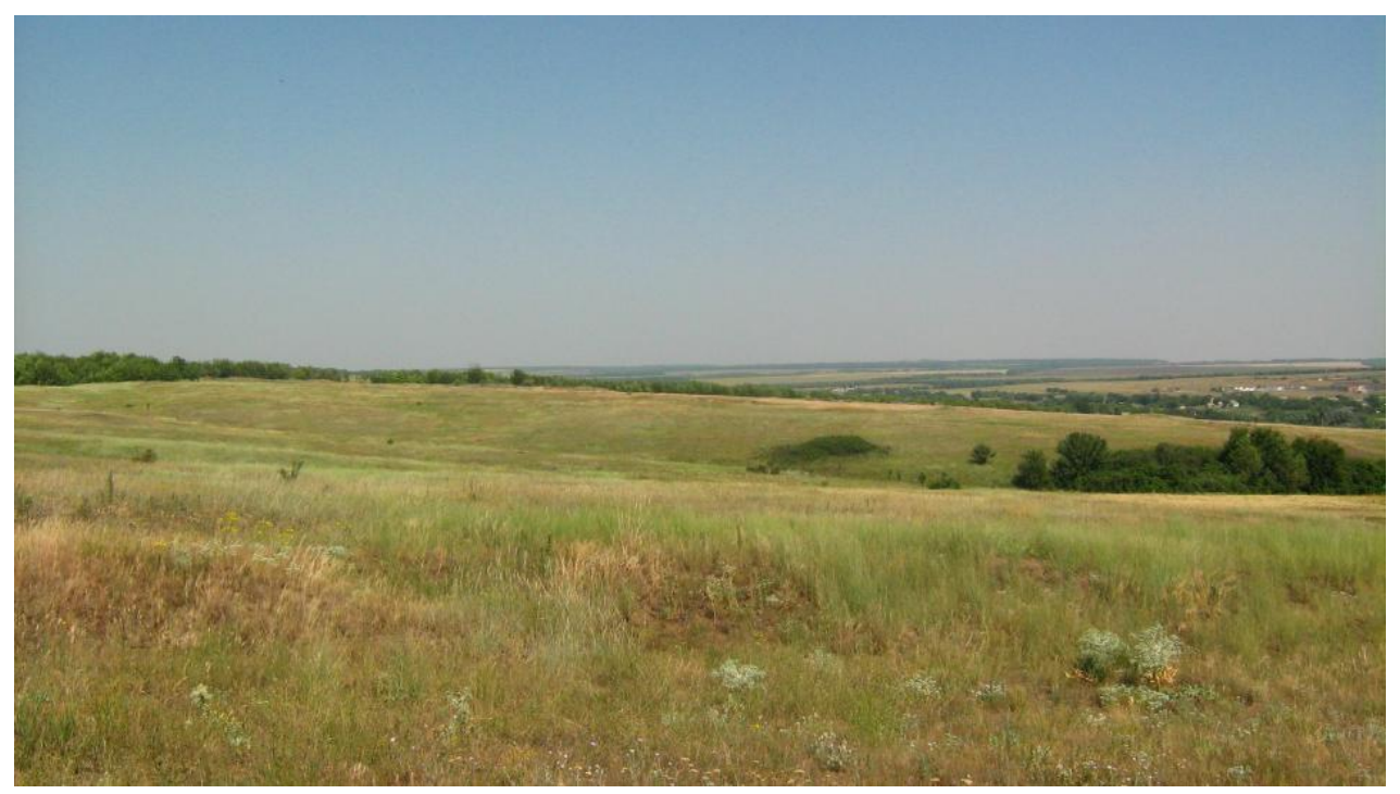
Southern Ukrainian Steppe (Zaporizhia region) in 2007

The area was populated, beside Tatars, by another Muslim nomadic people, the Nogais, which lived in the Northern Black Sea region from the end of the eighteenth to the middle of the nineteenth century and who also kept camels in their households. Emigration of these two ethnicities to the Turkish Empire during the nineteenth century and their eviction from Crimea during the Second World War were central elements of the gradual disappearance of camels from contemporary Ukraine during the twentieth century, together with the plowing of the steppe which led to the transformation of the nomadic cattle economy into settlement agriculture during the nineteenth century, as well as the development of transport infrastructures and agricultural mechanization. Now there are only small numbers of camels that are used exclusively as tourist attractions.