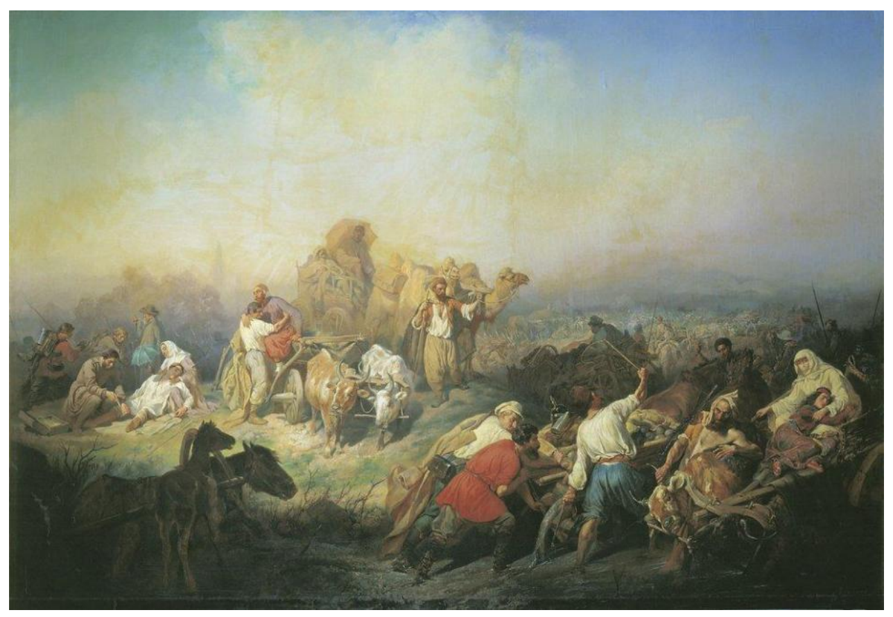
The use of camels in military times

of all spheres of life in the new imperial territories, the regional authority borrowed some economic traditions from the Crimean Tatars, including the use of camels. This was due to both the need to facilitate the painless integration of the local people and the peculiar natural conditions of the new lands that were uncharacteristic for the Russian Empire.