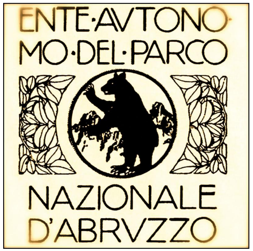
After the dismantling of the royal hunting reserve in 1912, the Marsican bear was threatened with extinction. This was the main reason for the proposal of a national park in the area.

was located at high altitude; its supporters envisioned a national park like the one that had been created in Switzerland in 1914, which was mainly devoted to scientific research. Moreover, the Royal House and the King personally endorsed the proposal since the new institution meant they would not have to dismiss the gamekeepers of the royal hunting reserve; instead, the gamekeepers could become the national park's new rangers.