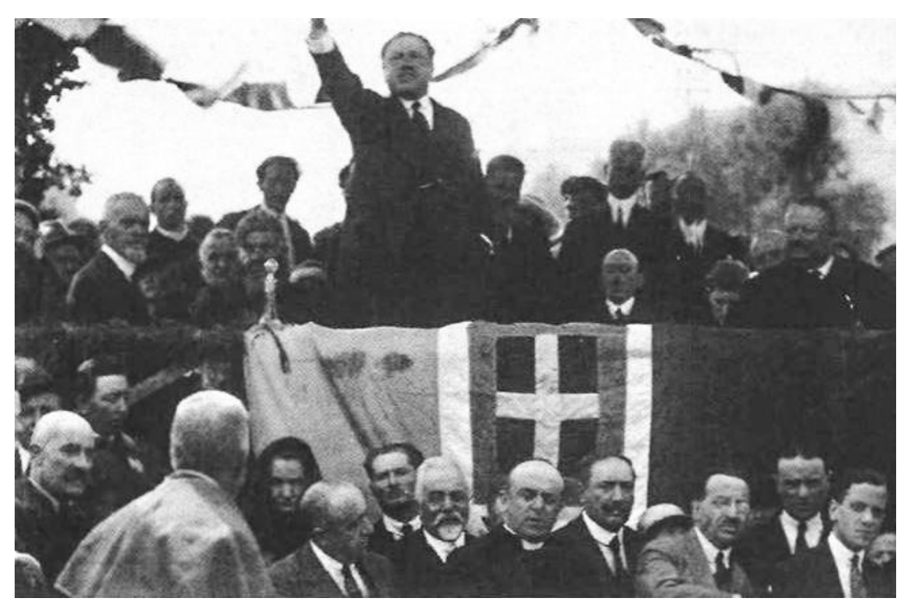
9 September 1922: Local member of Parliament Erminio Sipari inaugurates the Abruzzo National Park as a private reserve. Four months later it will be recognized by the state.